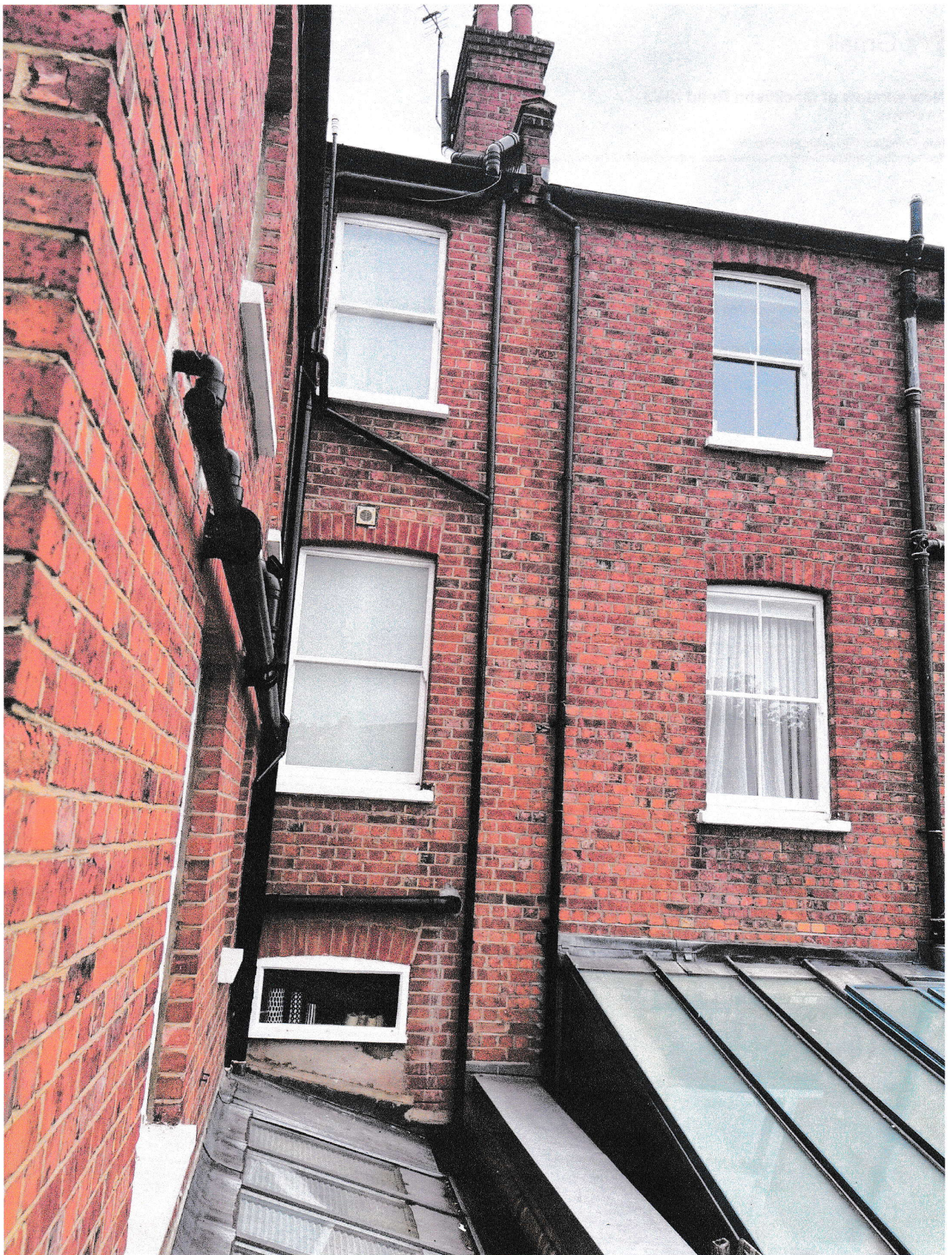
10 Mackinson Road NW3 Rear view, Sept. 24