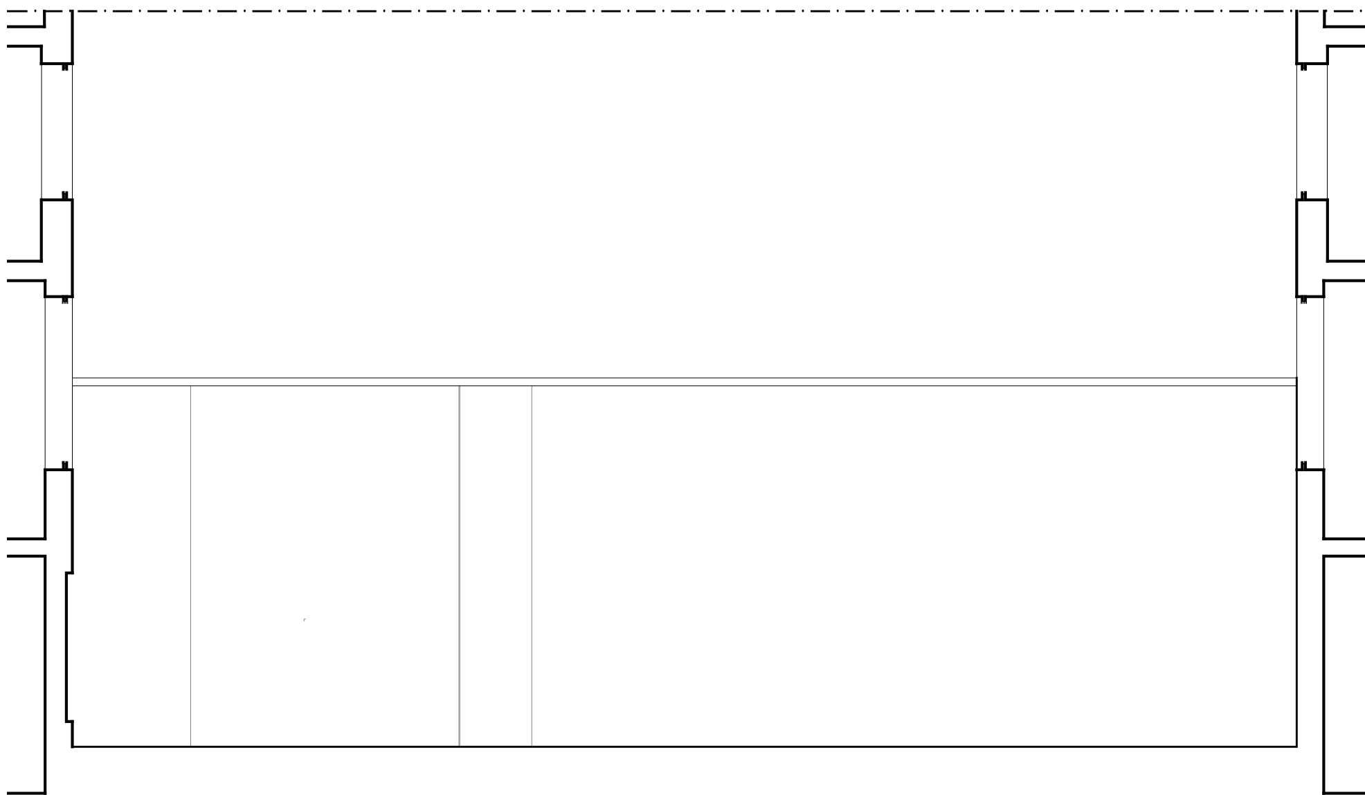
EXISTING SECTION A