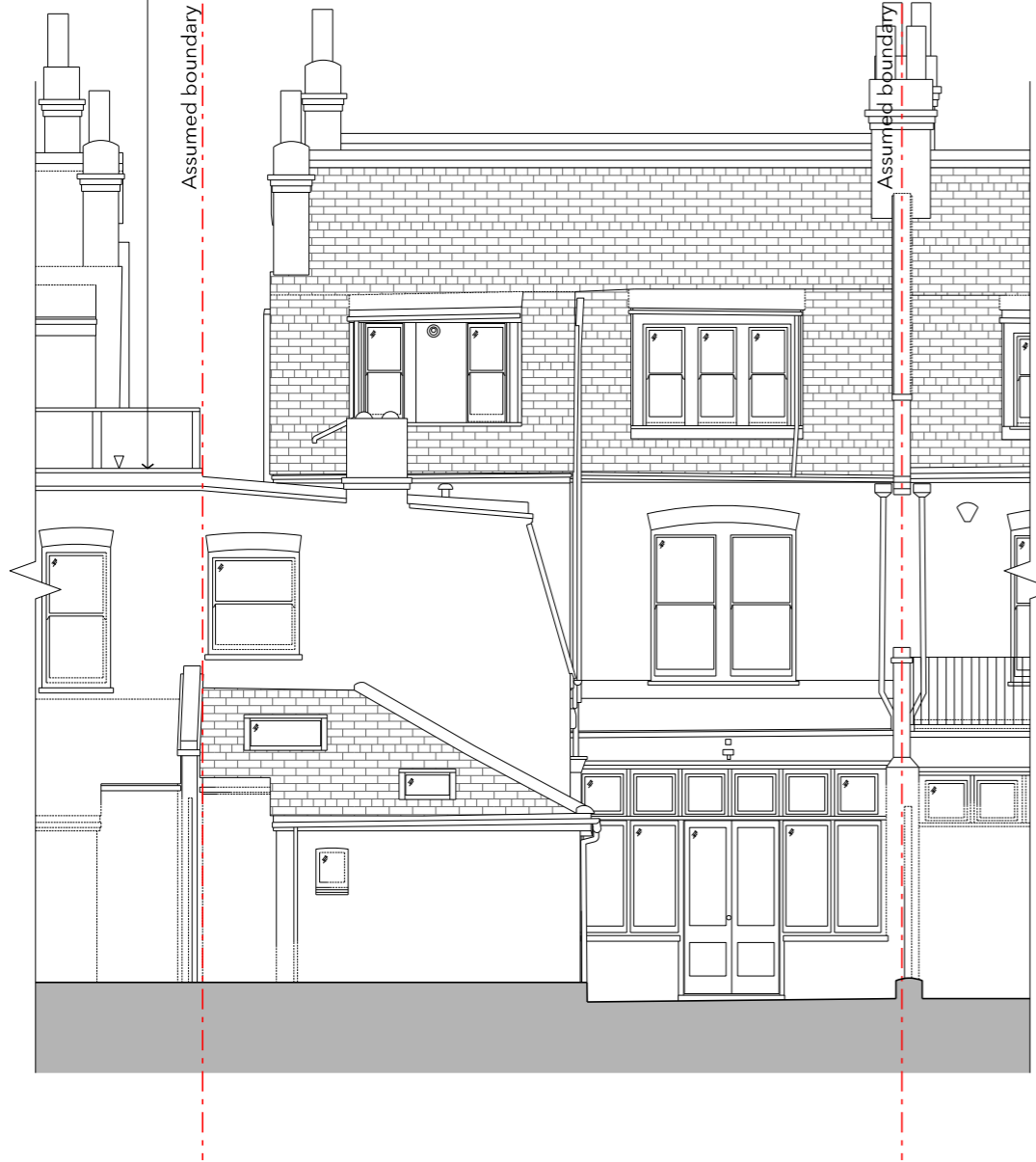
01: Existing Rear Elevation Scale 1:100 @A3