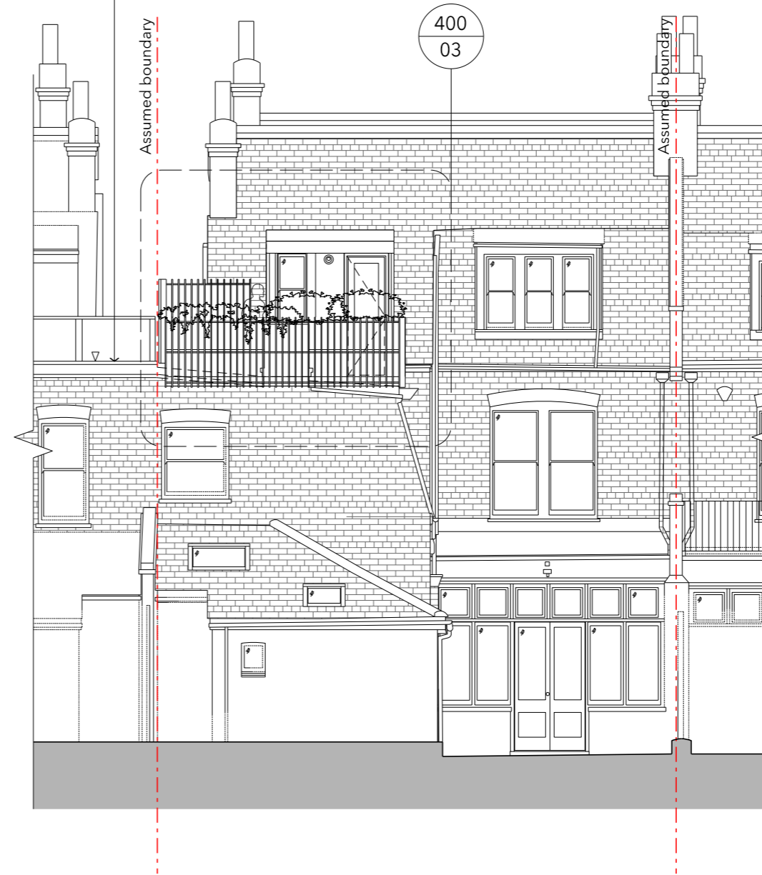
02: Proposed Rear Elevation Scale 1:100 @A3