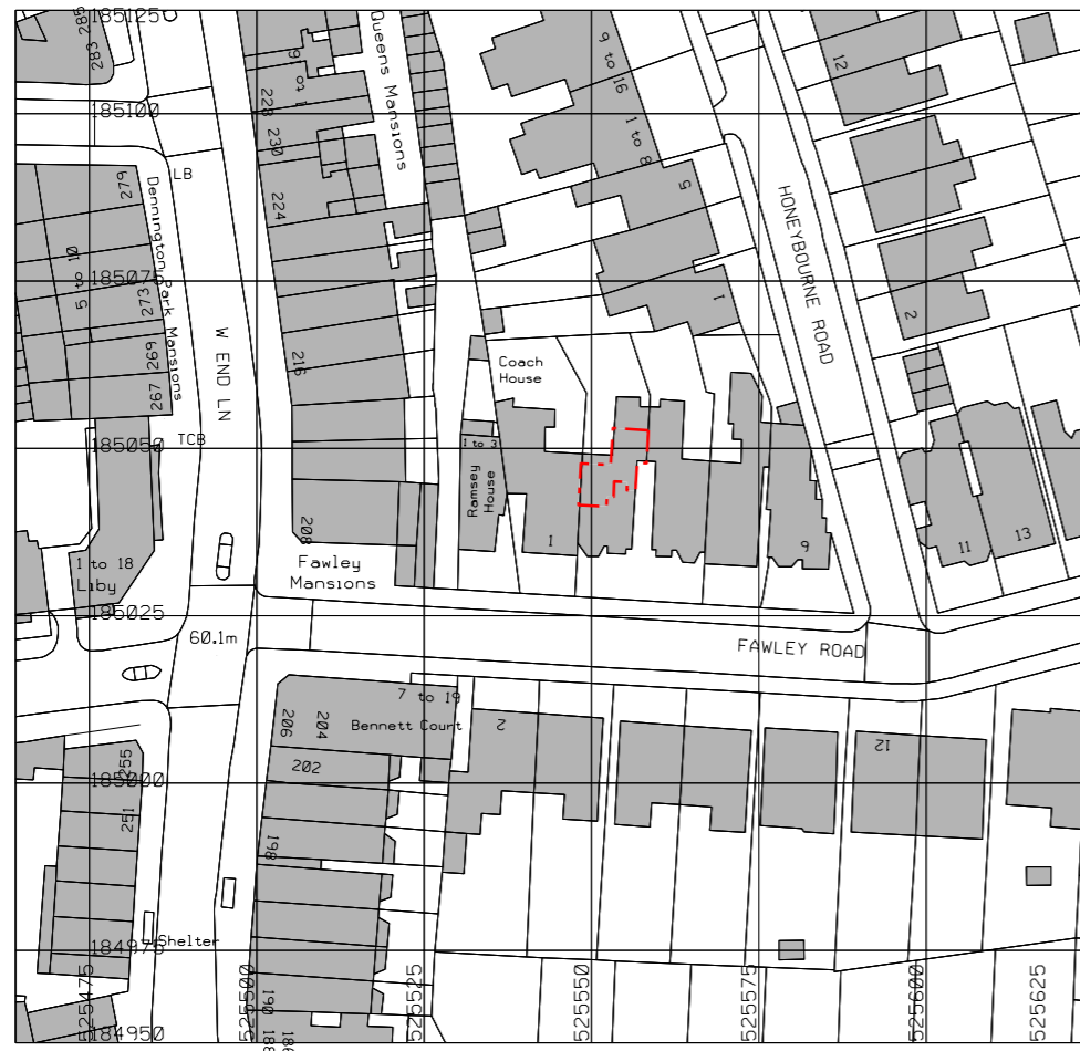
01: Site Location Plan Scale 1:1250 @A3