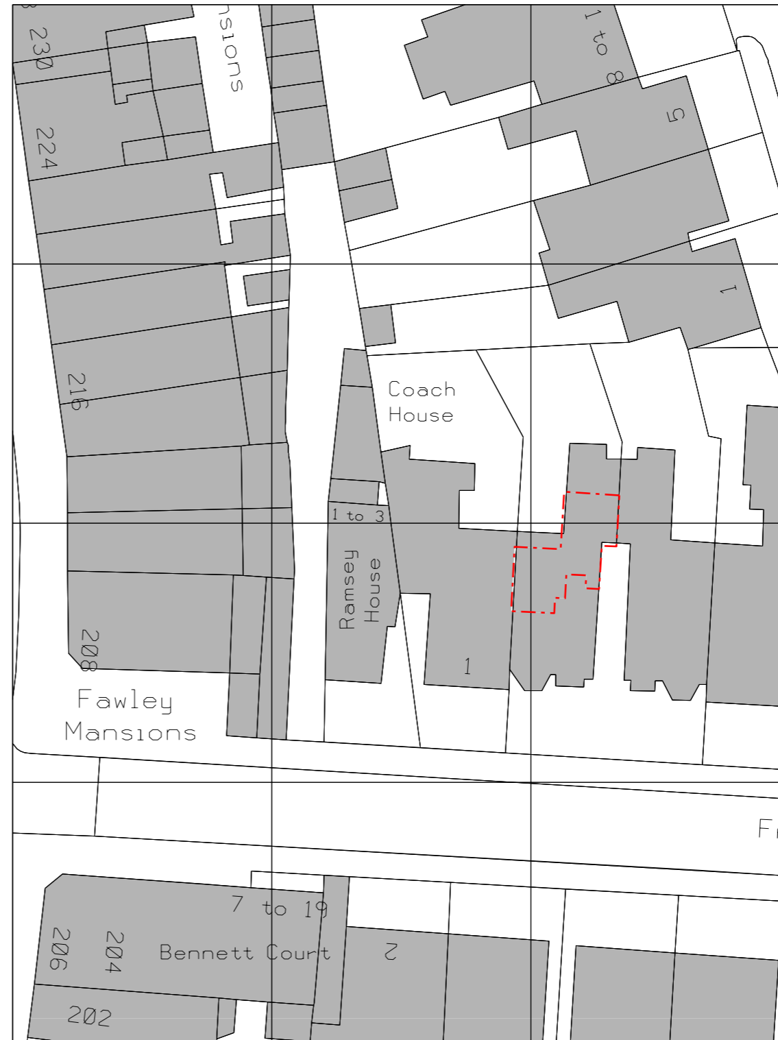
02: Site Block Plan (existing and proposed is the same) Scale 1:500 @A3