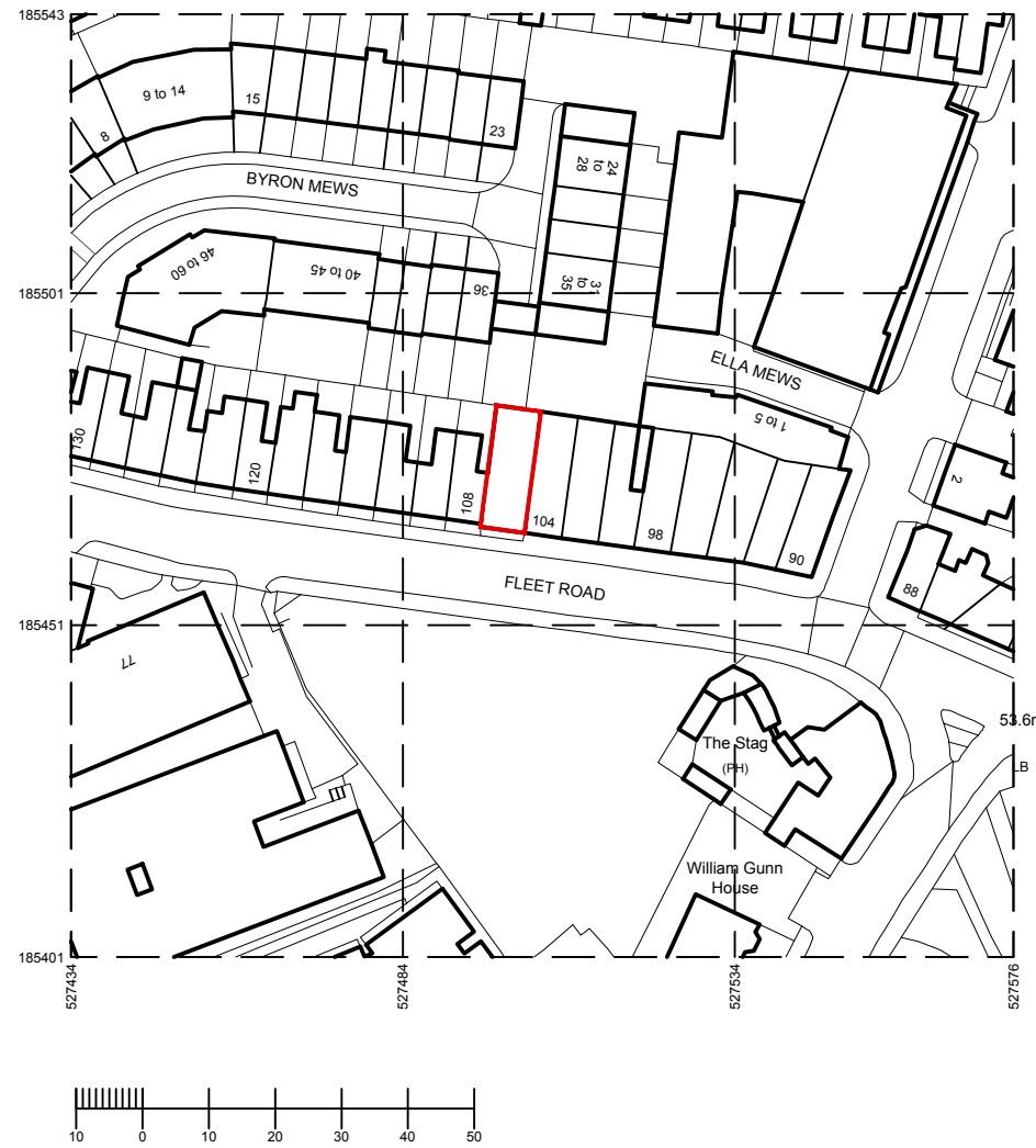
PROPOSED LOCATION PLAN Pharmacy | Fleet Road