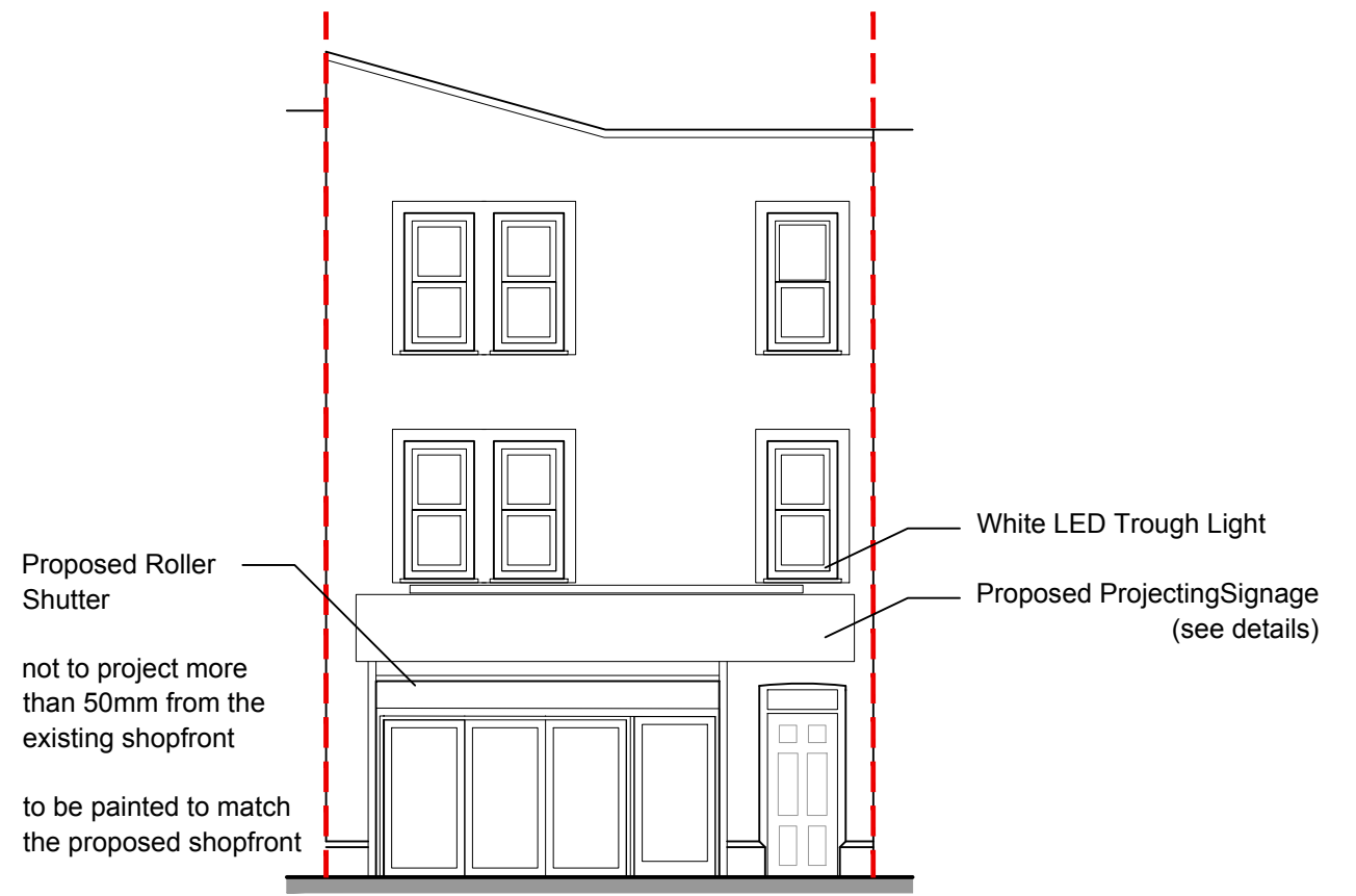
PROPOSED ELEVATION A Pharmacy | Fleet Road

do not scale from this drawing all dimensions are in millimetres contractor to confirm all dimensions on site any discrepancies to be notified to the draughtsperson in writing before work commences this drawing is the copyright of Optimising Spaces