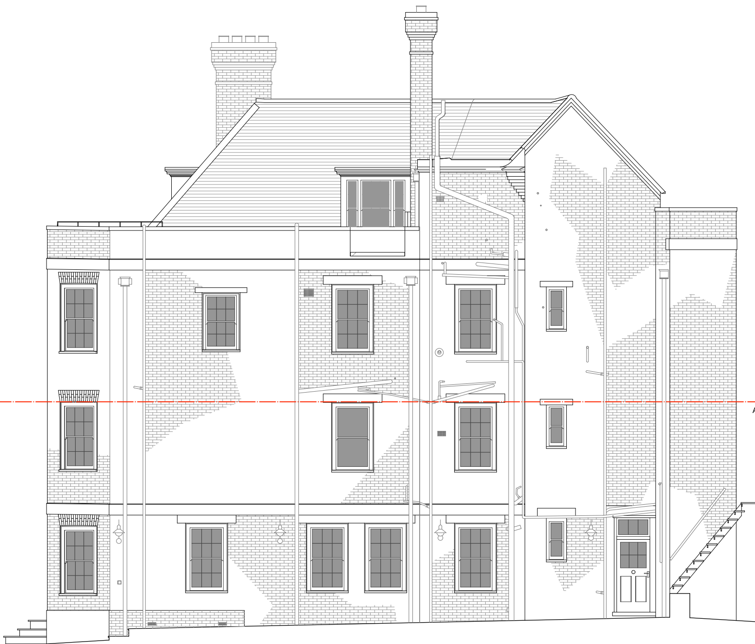
PROPOSED SIDE-1 ELEVATION