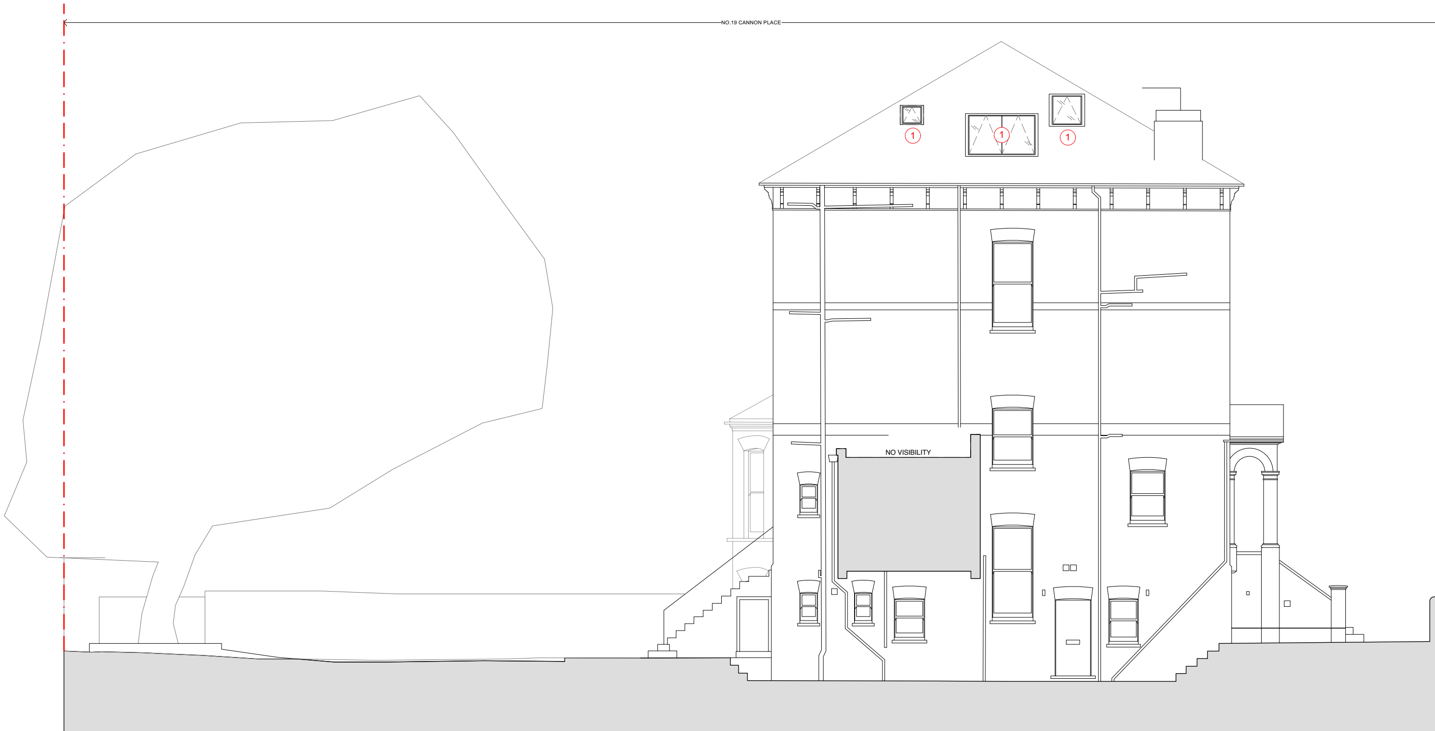
1 Proposed Side Elevation Scale: 1:100