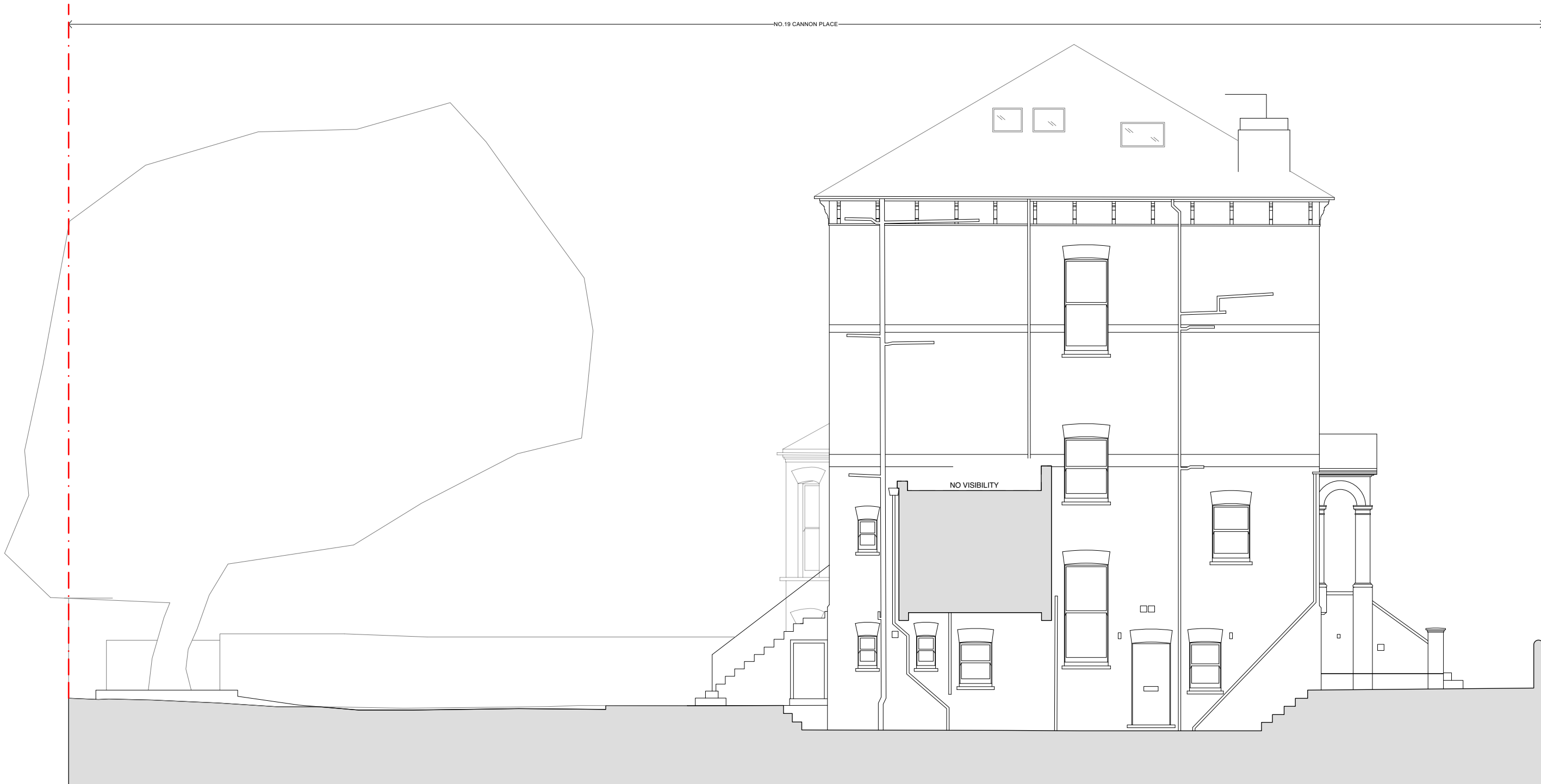
1 Existing Side Elevation Scale: 1:100