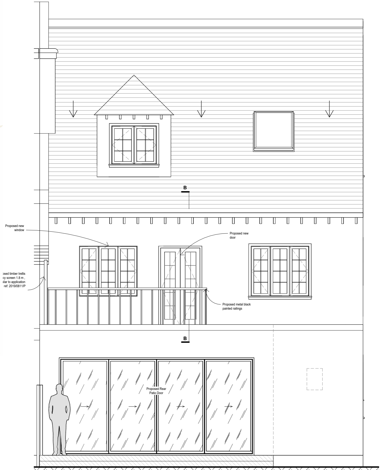
Proposed Rear Elevation Scale 1:50