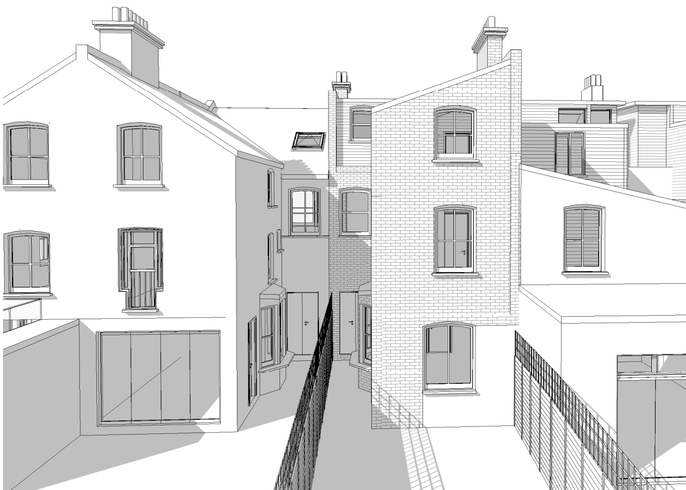
3D View 1_Proposed