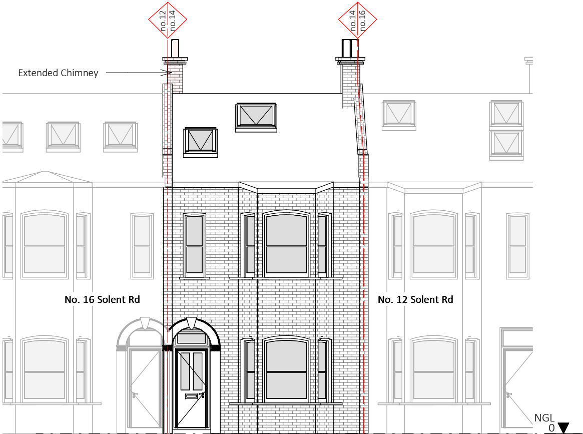
Proposed South Elevation scale 1 : 100