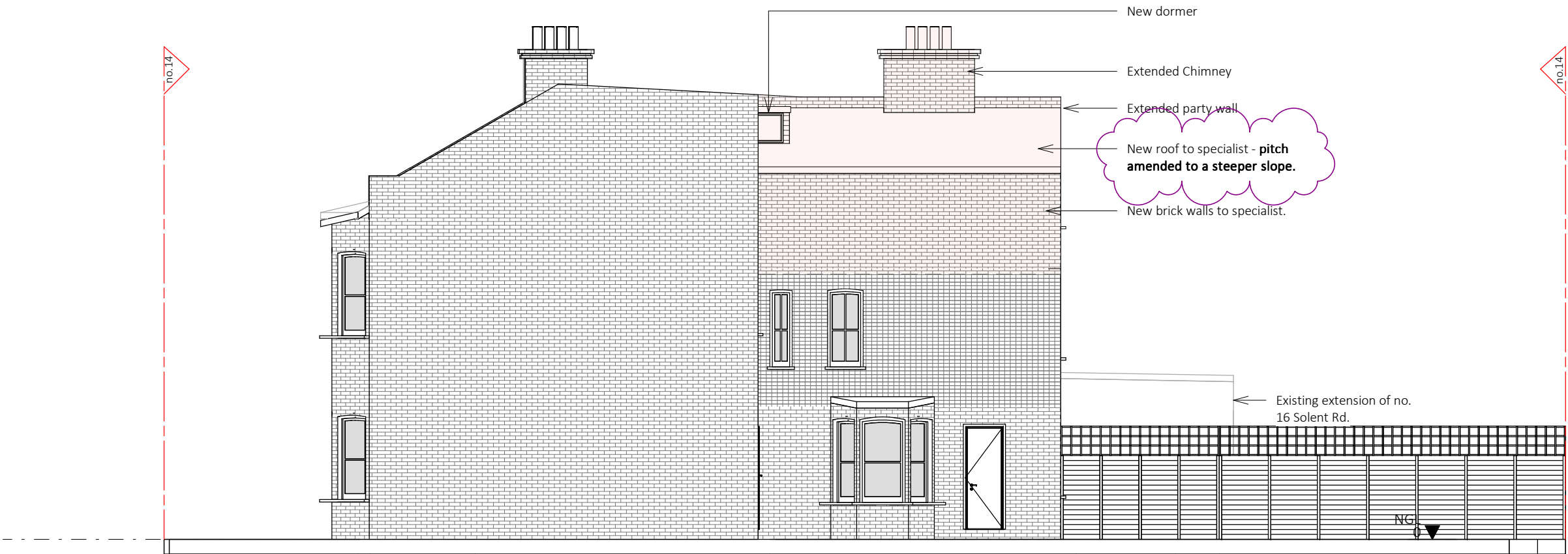
Proposed East Elevation scale 1 : 100