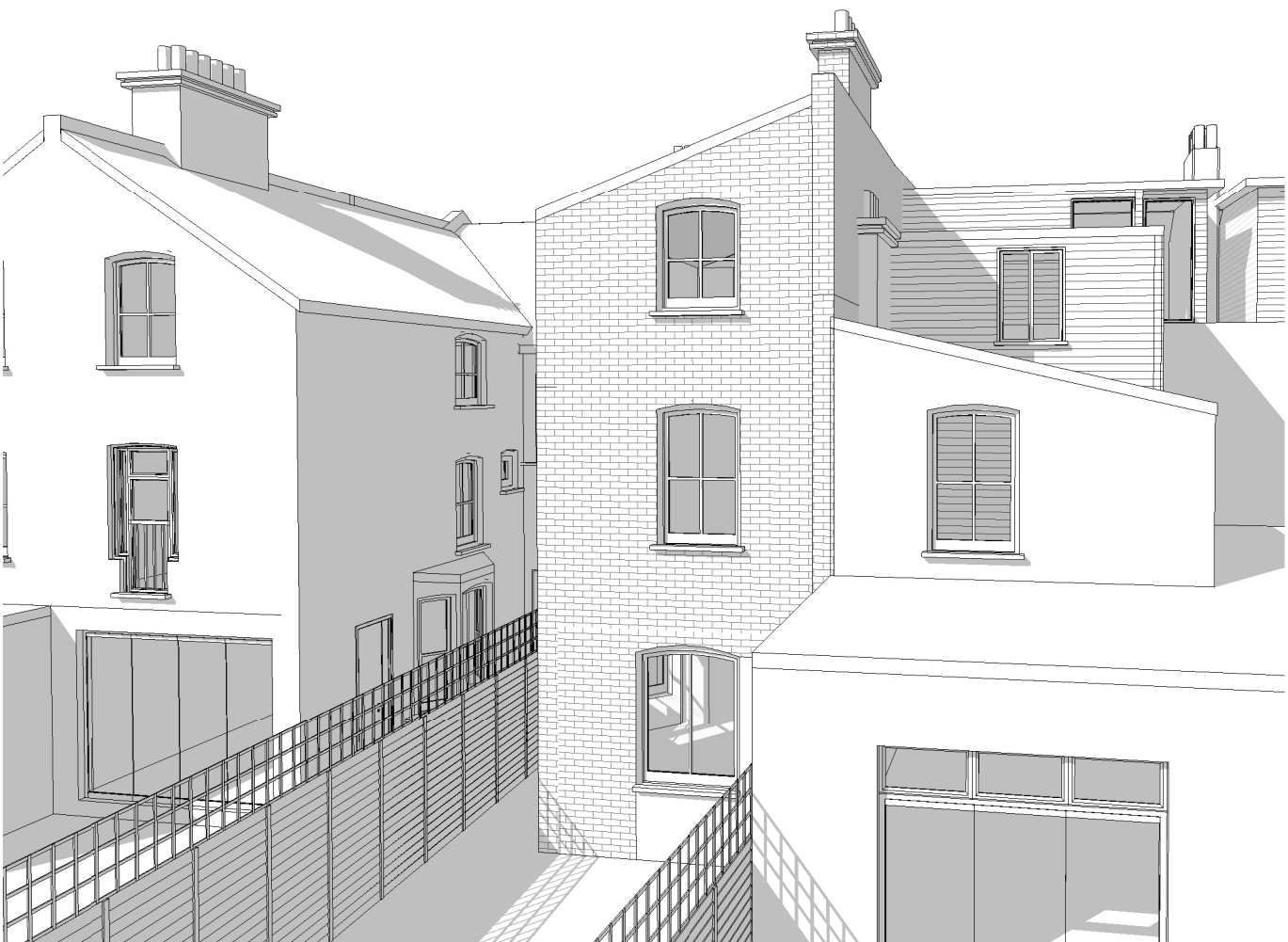
3D View 2_Proposed

GENERAL NOTE All building work to comply with SANS 10400. Figured dimensions to be used in preference to scaling. This drawing is to be read in conjunction with other documents and/or documents by other Consultants. Contractor to verify all dimensions, levels and quantities on site prior to putting any work to hand. Specified tradenames may be substituted for 'equal or approved' subject to Architects confirmation. Contractor to adhere to all SABS codes and manufacturer's instructions. Any discrepancies to be reported to the Architect immediately. Copyright © reserved.