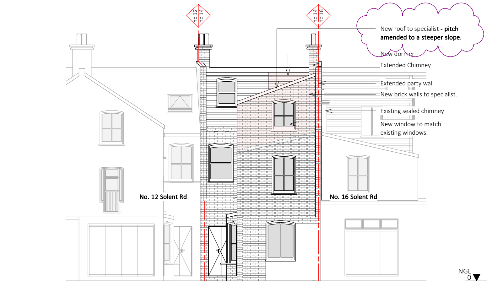
Proposed North Elevation scale 1 : 100