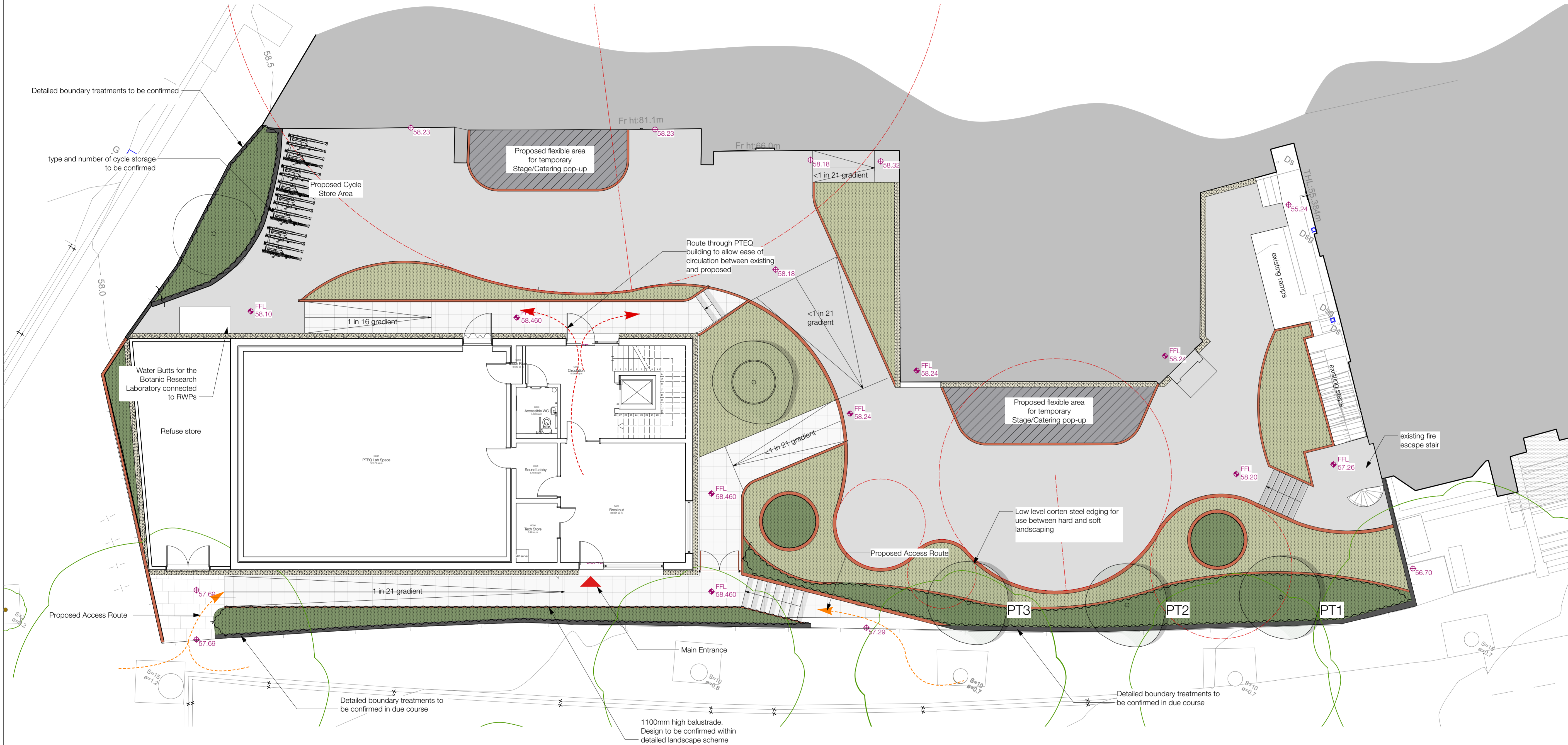
Proposed Landscape Design Scale: 1:100