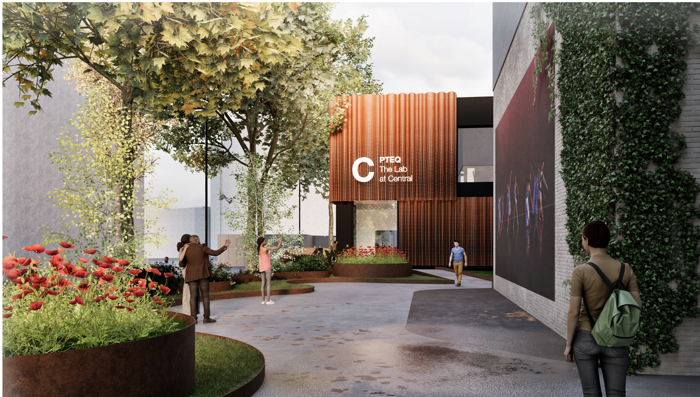
View from North East

N.B. Signage, detailed boundary treatments, and landscaping are indicative only and will be confirmed in due course