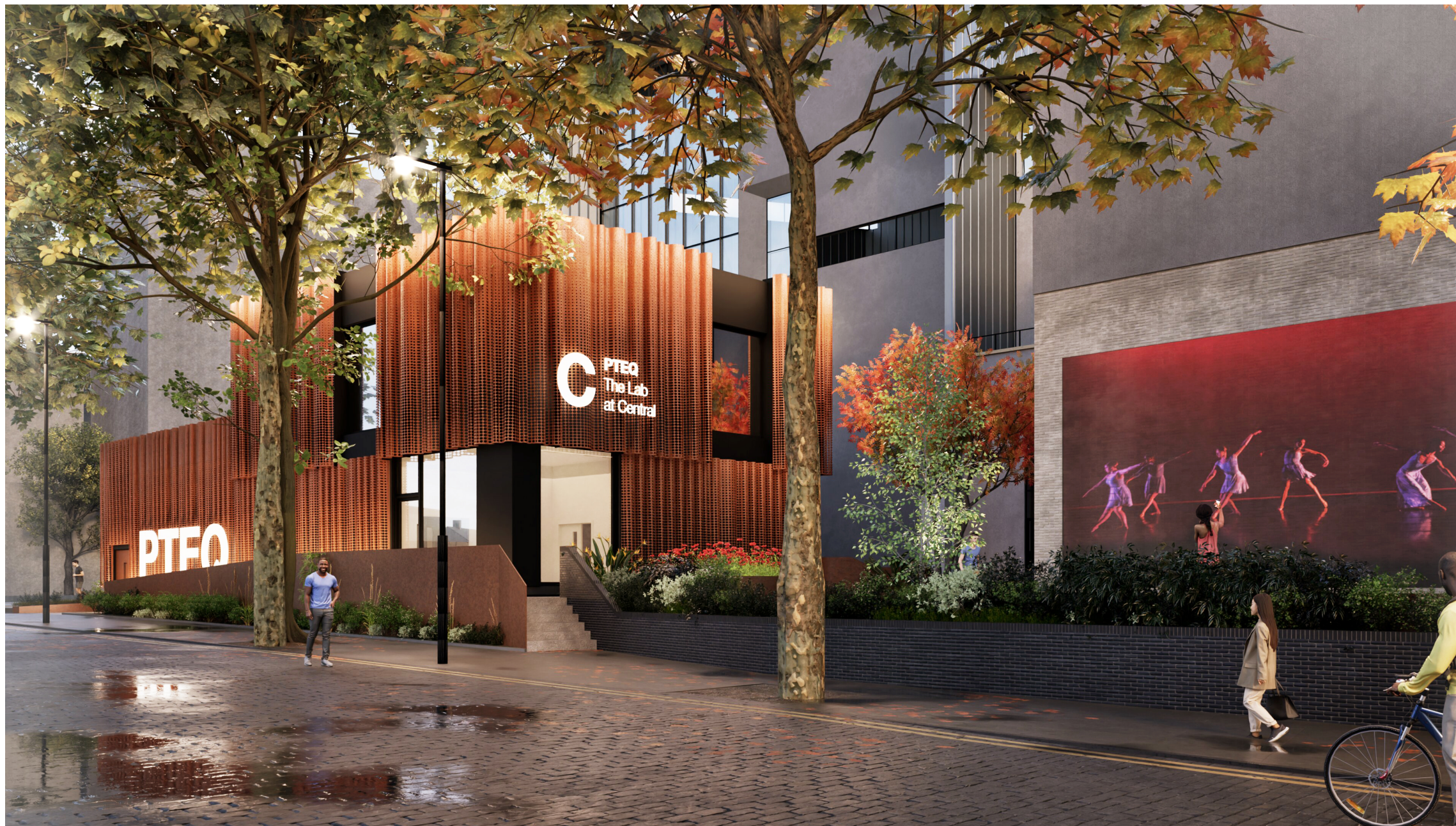
View from Eton Avenue

N.B. Signage, detailed boundary treatments, and landscaping are indicative only and will be confirmed in due course