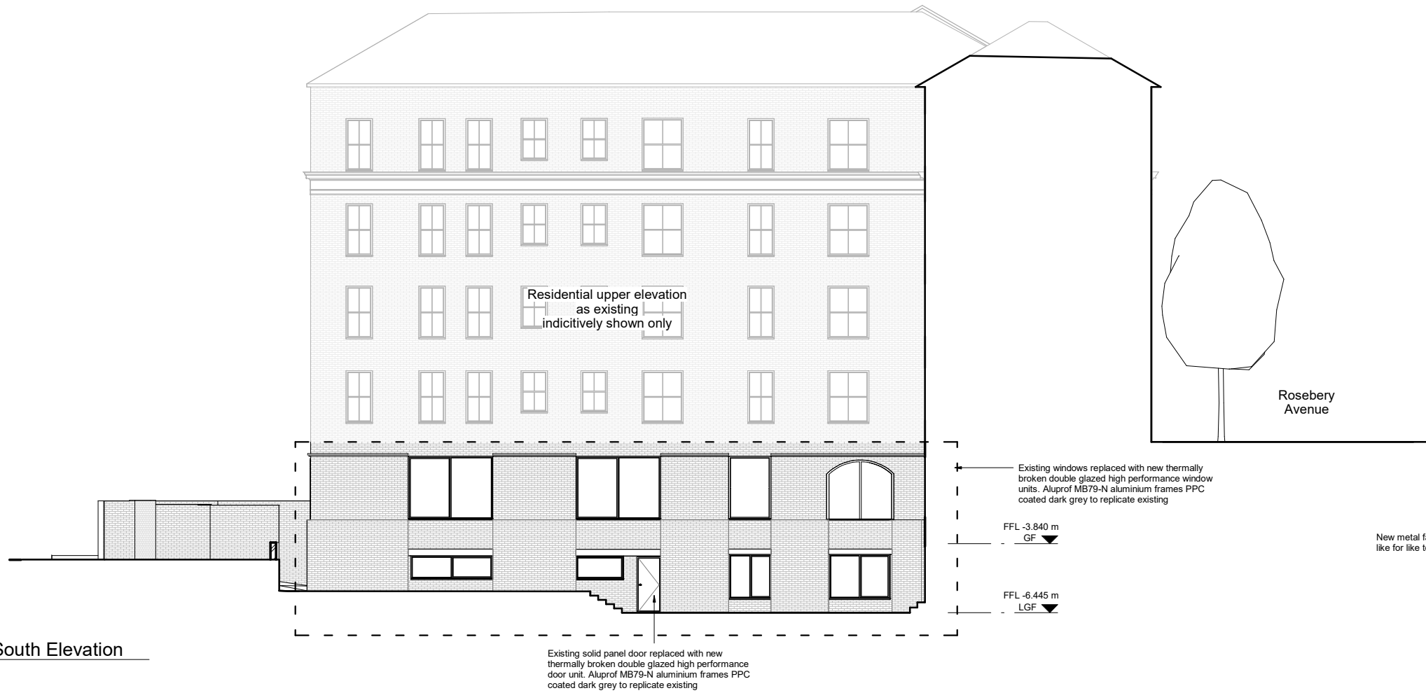
1 South Elevation