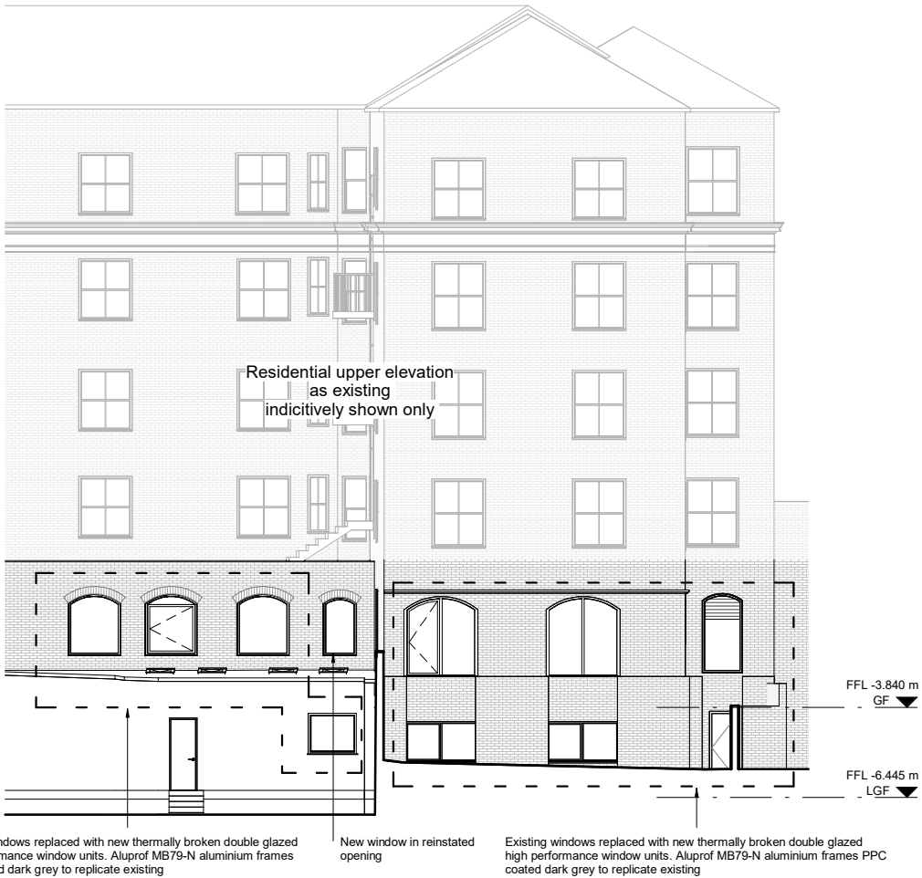
3 West Elevation