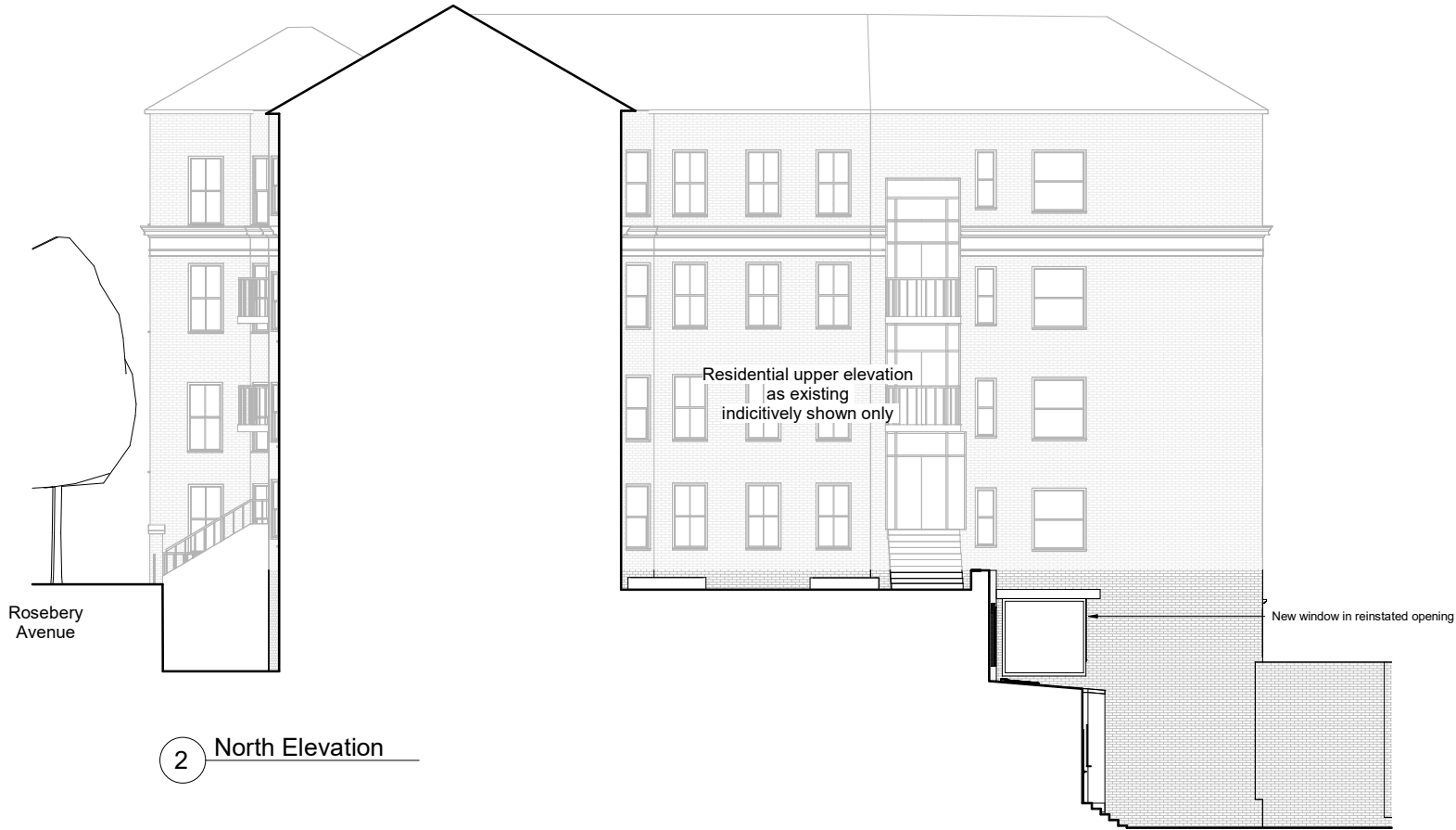
2 North Elevation