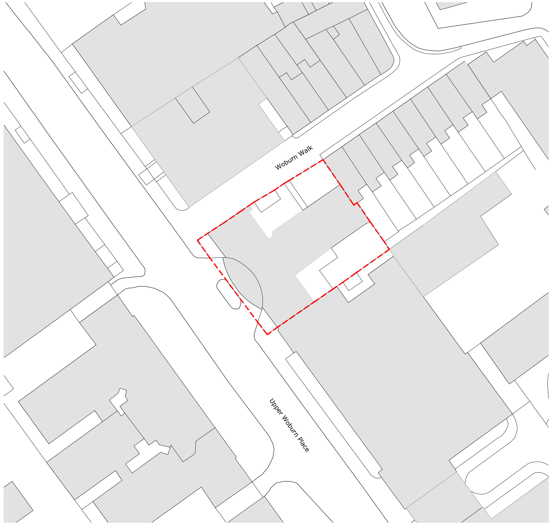
Site plan @ 1:500