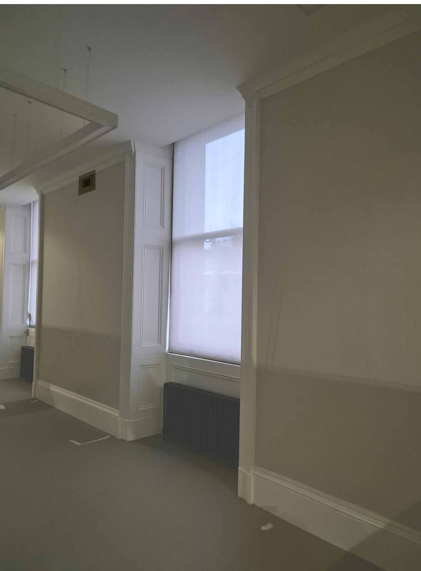
B/4/021 OFFICE (one room)