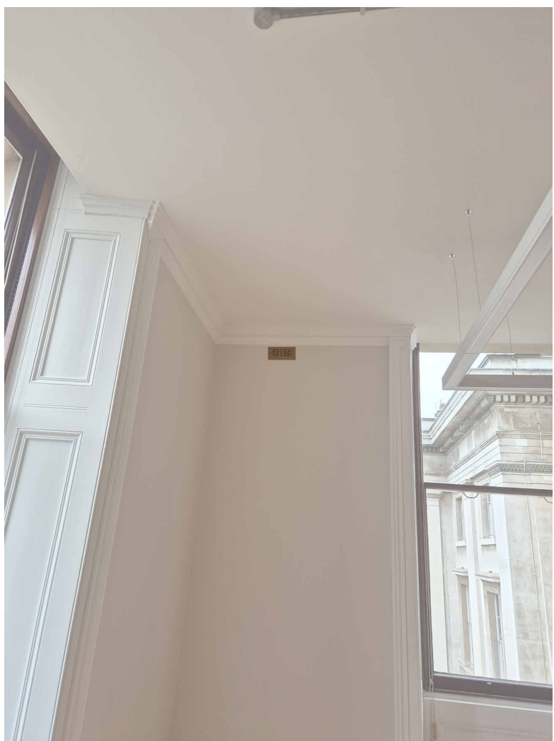
B/4/021 OFFICE (one room)