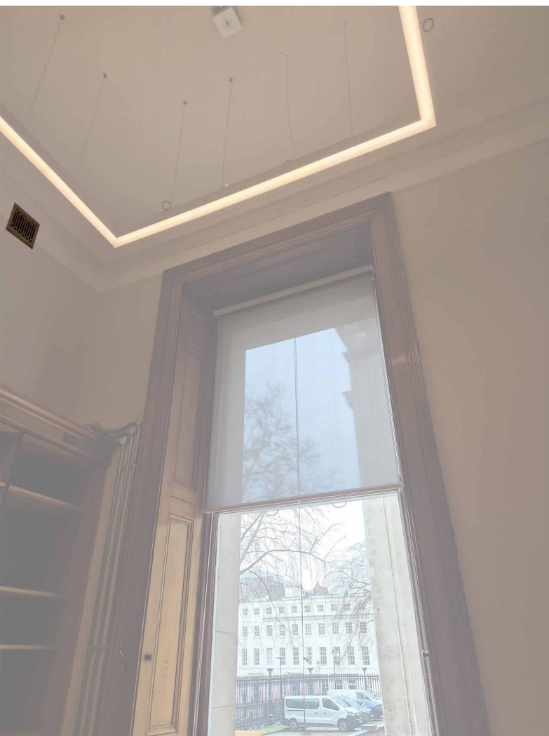
B/2/032 PREHISTORY & EUROPE STUDENTS ROOM