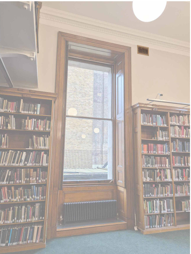
B/2/032 PREHISTORY & EUROPE STUDENTS ROOM