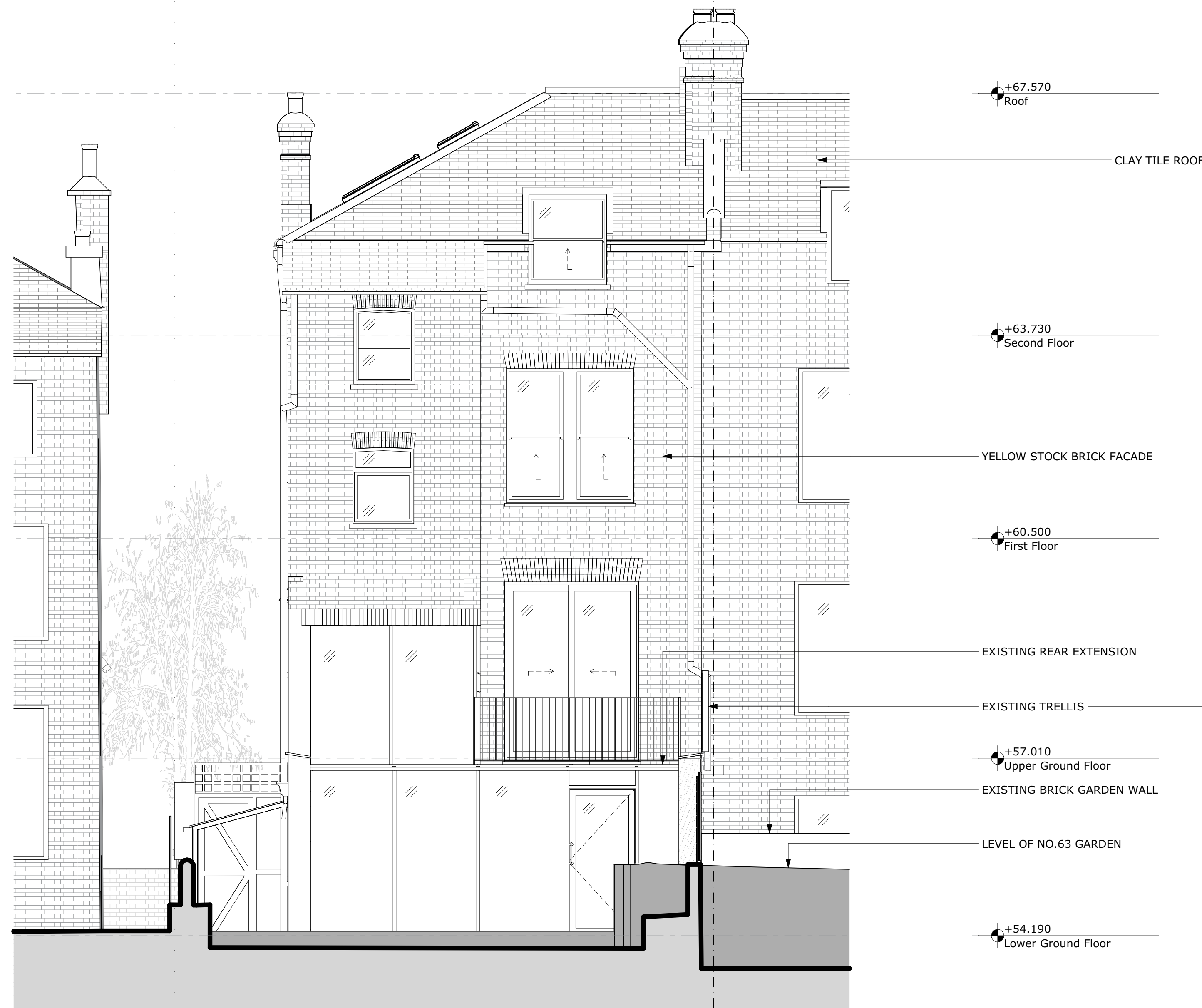
1 Existing South-East Elevation 1:50

No. 59 Dartmouth Park Road No. 61 Dartmouth Park Road No. 63 Dartmouth Park Road