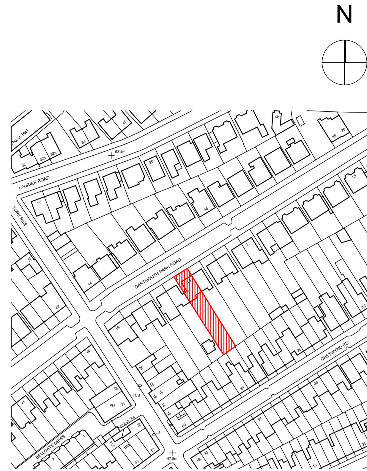
1 Site Block Plan 1:1250