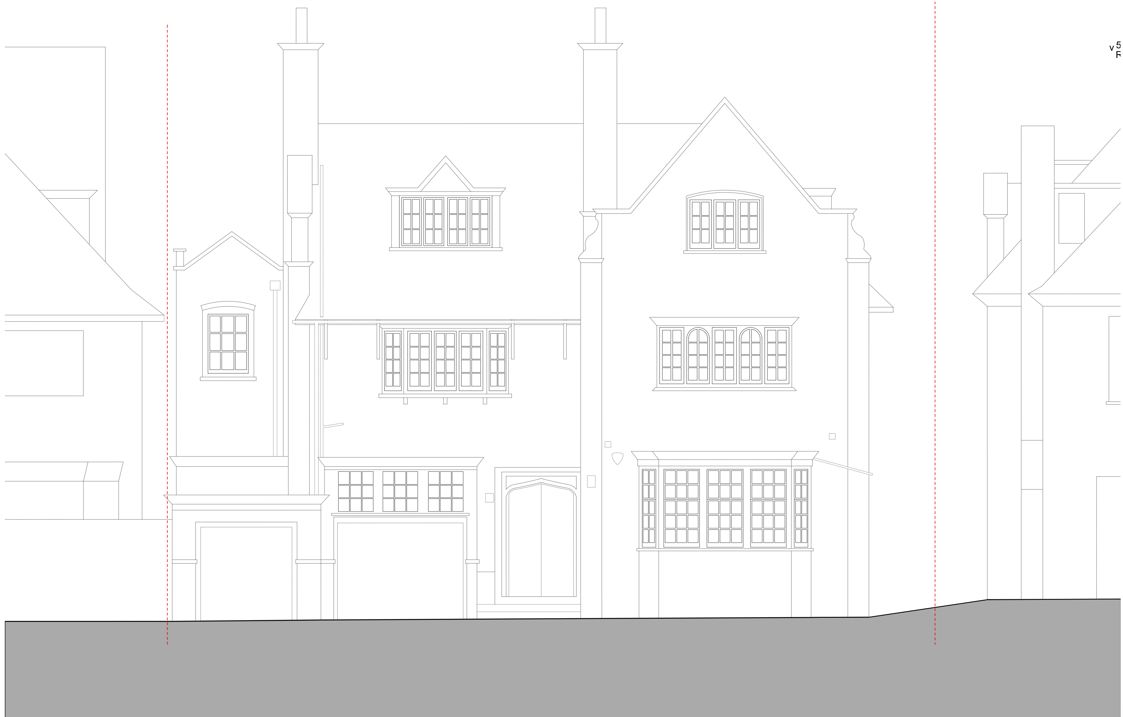
1 EXISTING FRONT ELEVATION Scale: 1:100@A3