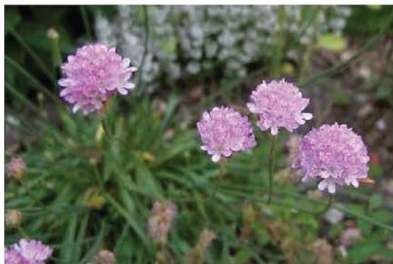
Armeria Maritima Thrift

Wildflowers often take 2-3 years to fully germinate and bloom with some only viable as annuals or biennials, so occasional reseedling is recommended.