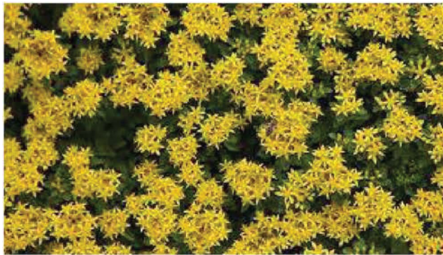
Sedum Middendorffianum var.