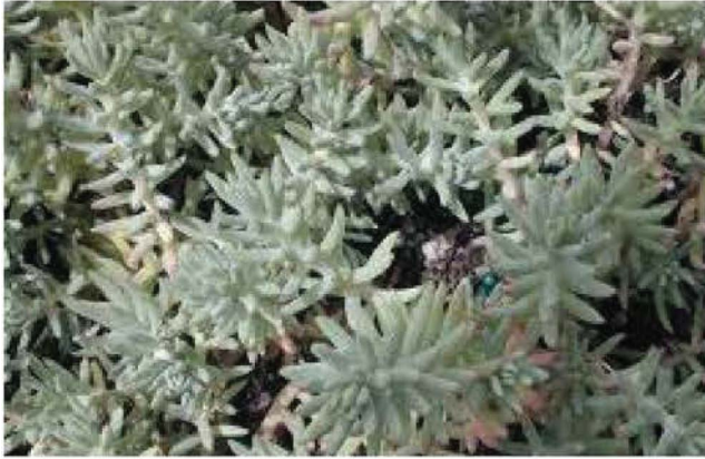
Sedum Montanum ssp Orientale