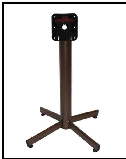
TILTING DINING SELF LEVELING TABLES X 18 Square top: 600 X 600 mm Base: 700mm high