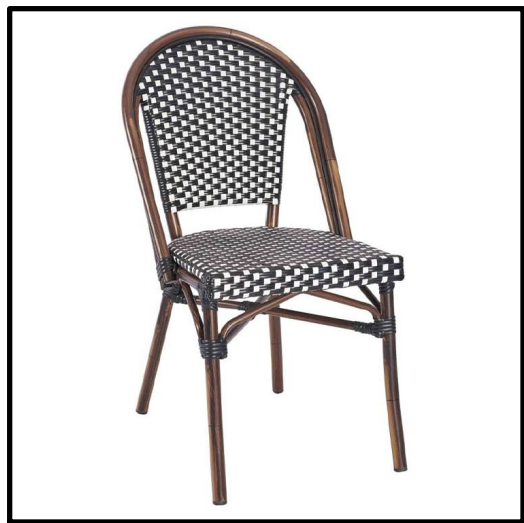
STACKABLE CHAIRS X 36 Back Height : 890 mm Chair Width : 430 mm Chair Depth : 400 mm Seat Height : 460 m