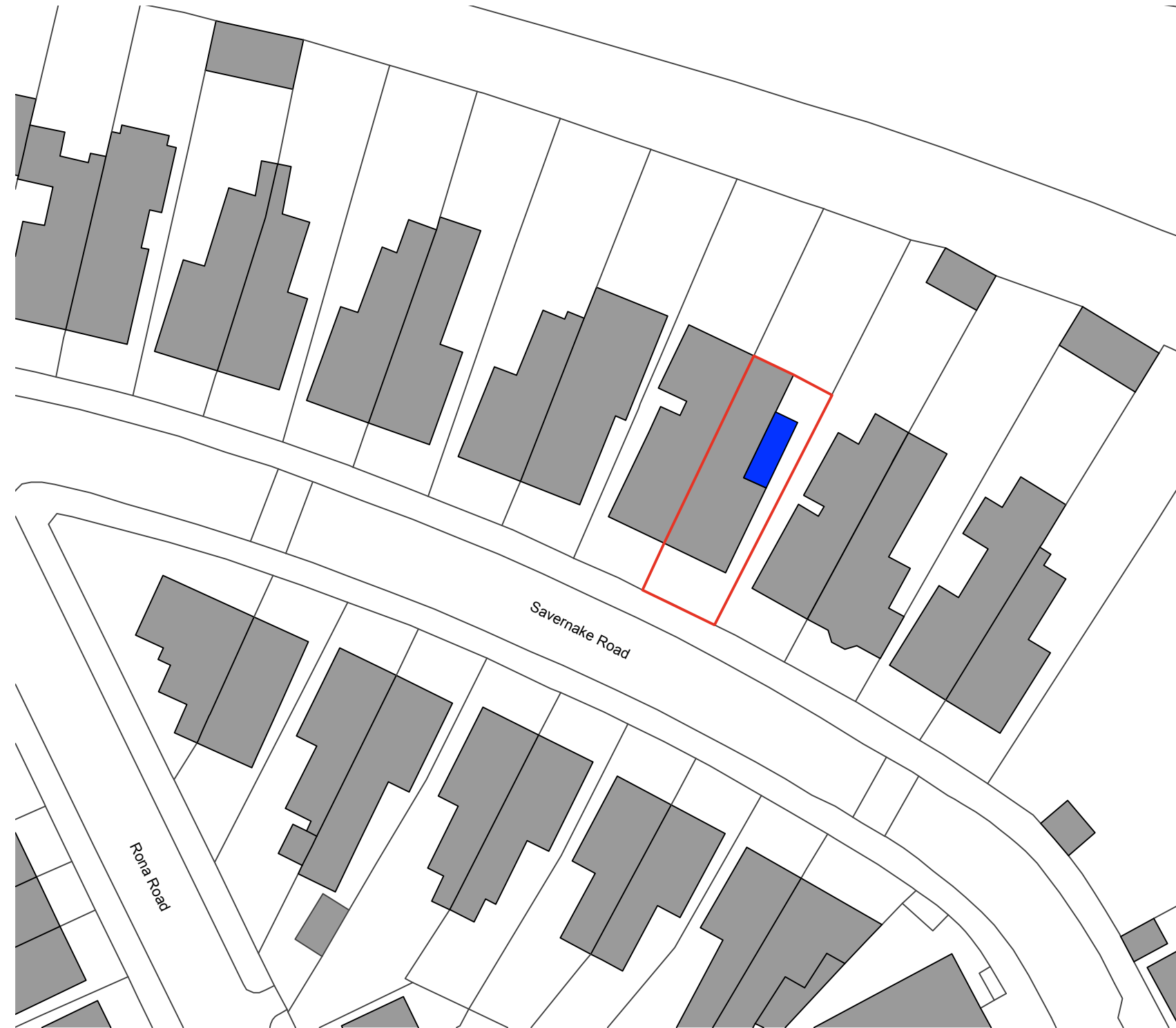
Block plan 1:500