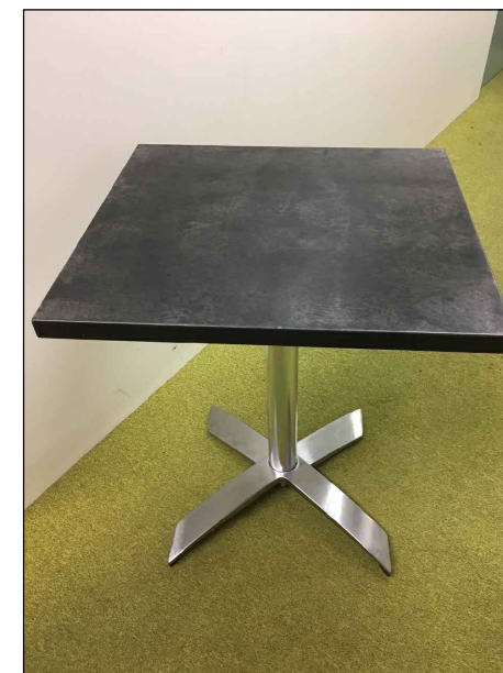
9 no. DINING TABLES 650m600x750mm