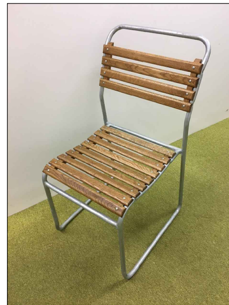
18 no. DINING CHAIRS