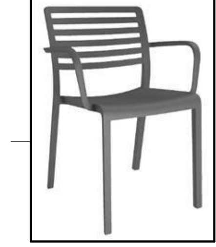
BENTLEY ARM CHAIR