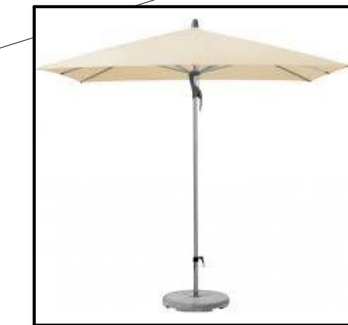
GLATZ FORTINO® GIANT UMBRELLAS, ALUMINIUM FRAME. 2000MM X 2000MM

UMBRELLA AND BASE TO BE USED FOR EACH TABLE.