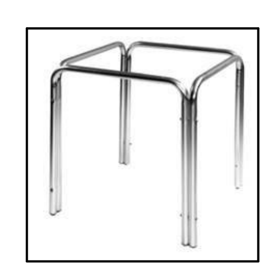
POLISHED ALUMINIUM STACKING BASE