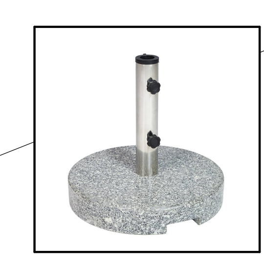
GRANITE UMBRELLA BASE, ROUND, 25KG UMBRELLA BASES BAG025S