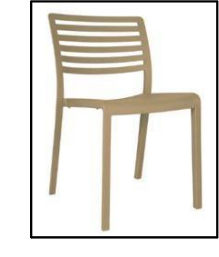
BENTLEY SIDE CHAIR