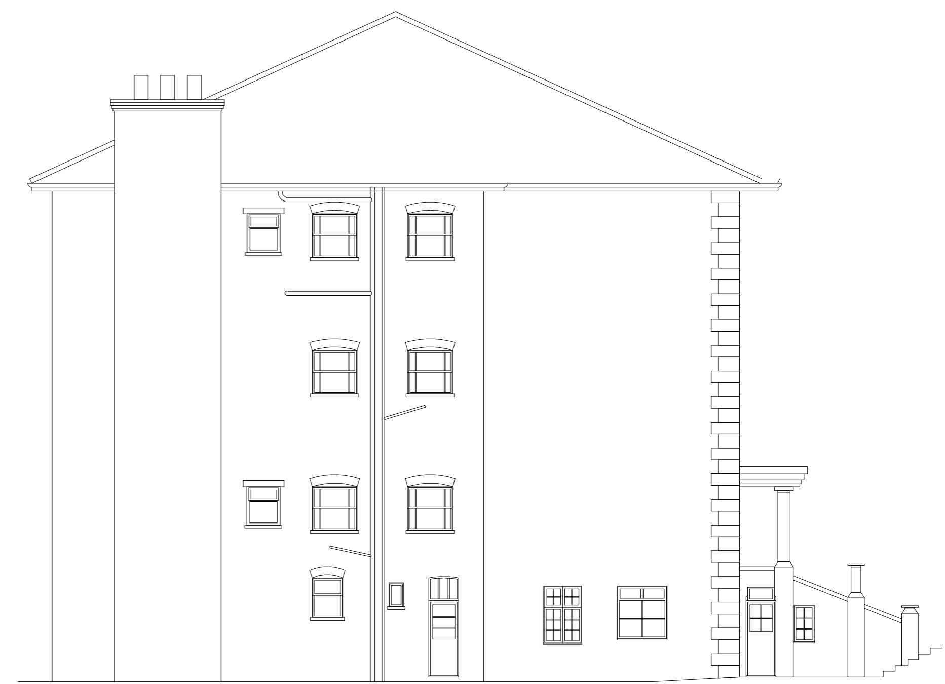
SIDE ELEVATION AS EXISTING AND AS PROPOSED NO EXTERNAL CHANGES REQUIRED