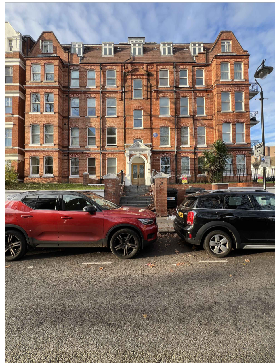
01 Existing South-East Elevation Photo