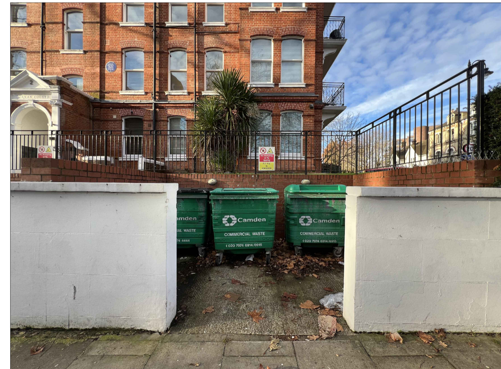
04 Existing Refuse Store 02 South-East View Photo