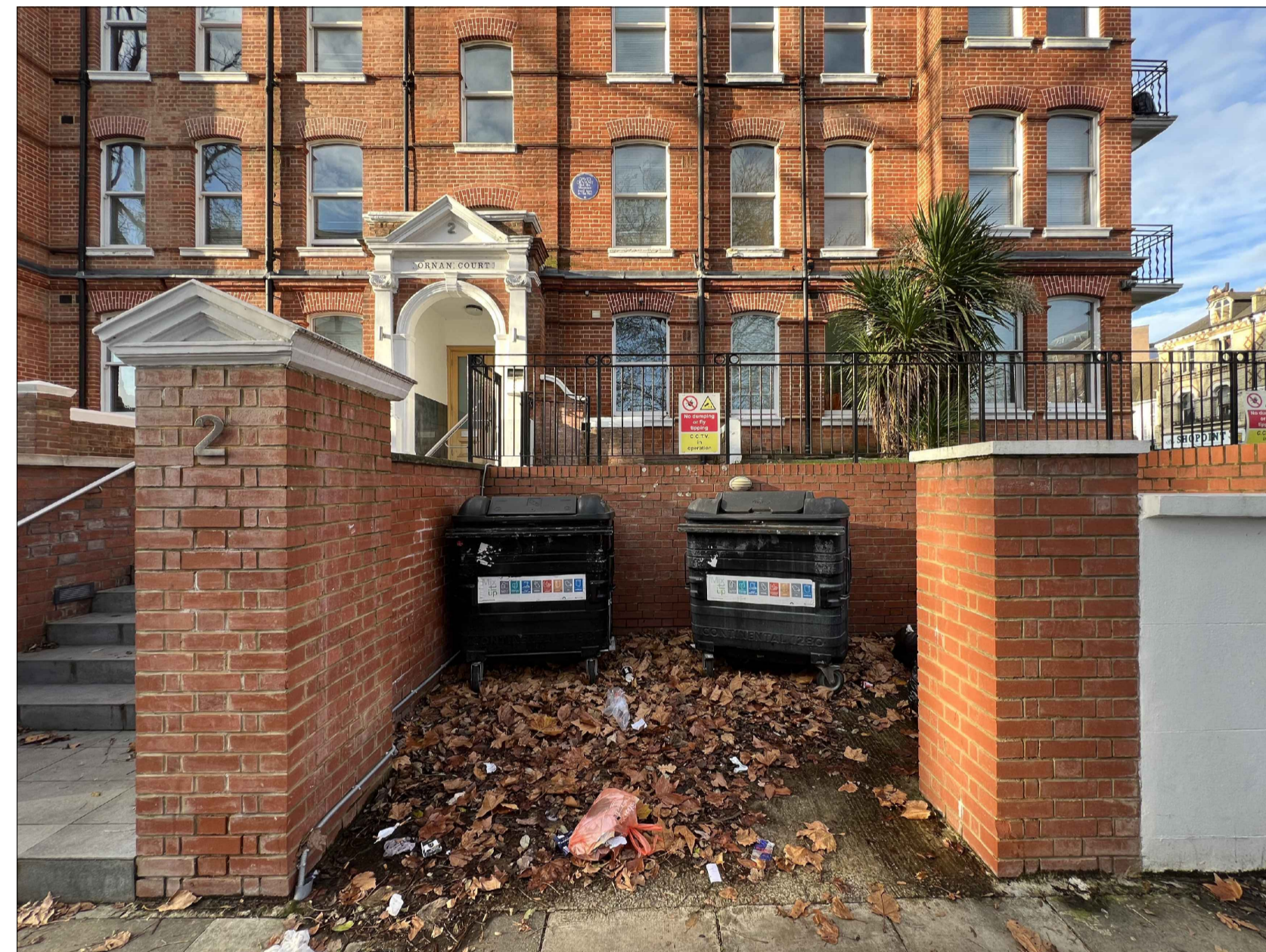
03 Existing Refuse Store 01 South-East View Photo