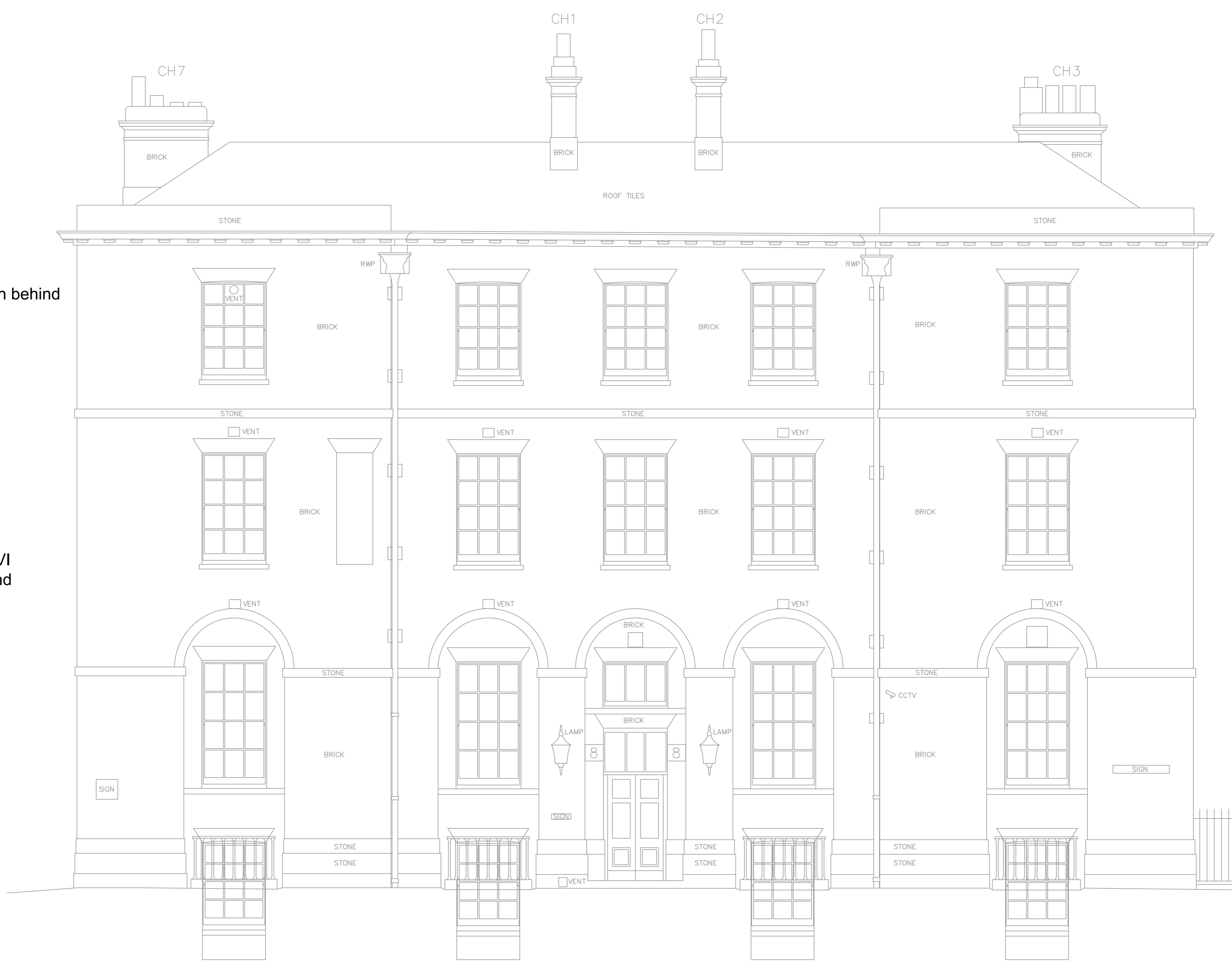
DATUM=17.00m ELEVATION 1

Legend: - - - - - Lightning protection HVI Conductor