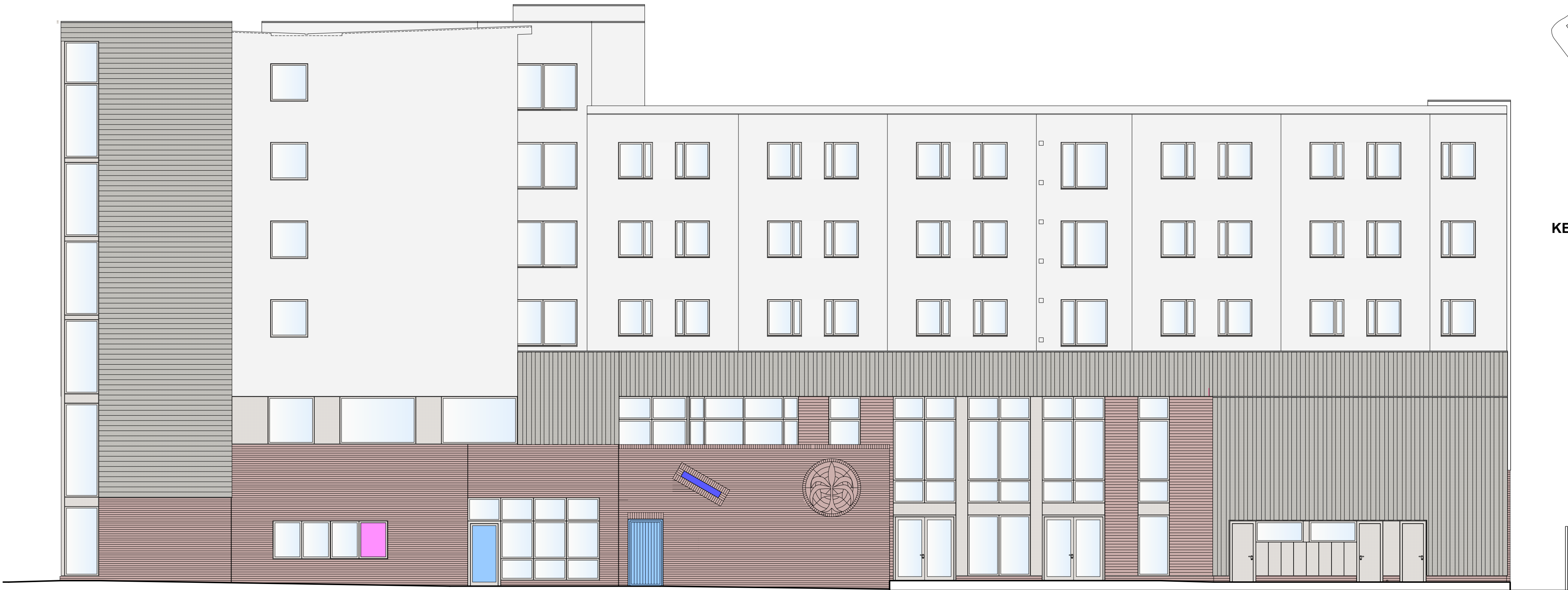
POLYGON ROAD - ELEVATION.