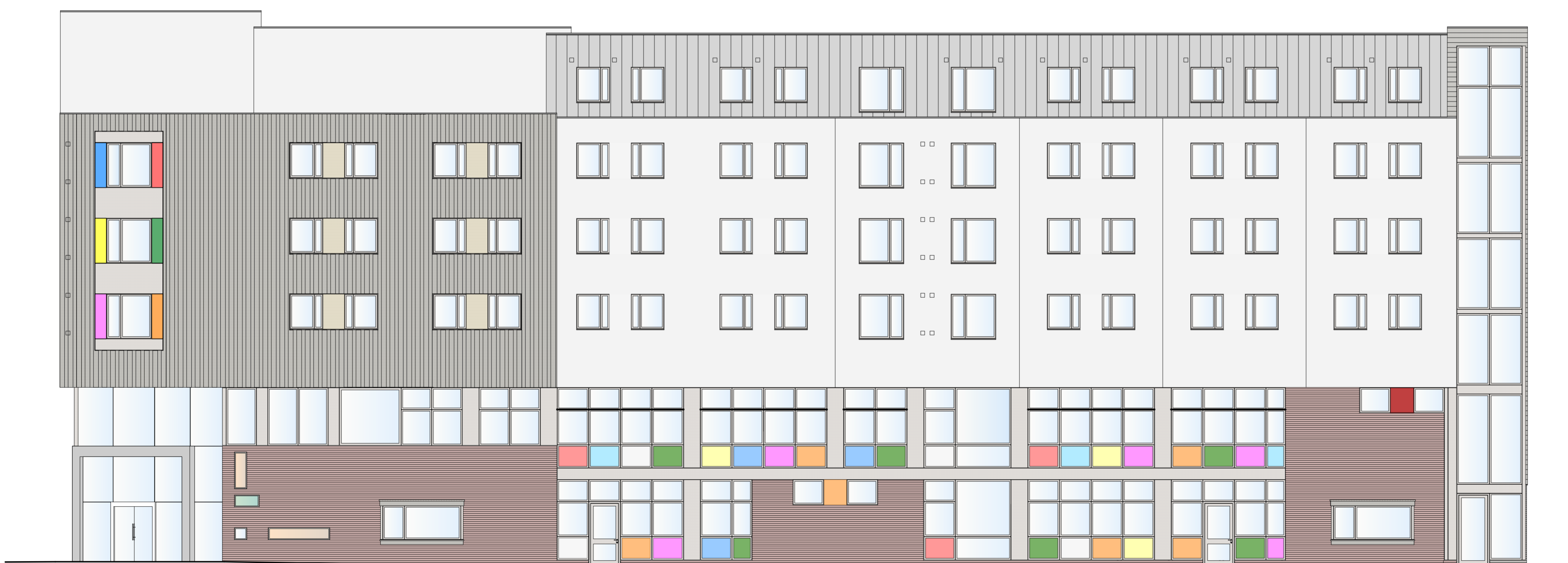
WERRINGTON STREET - ELEVATION.