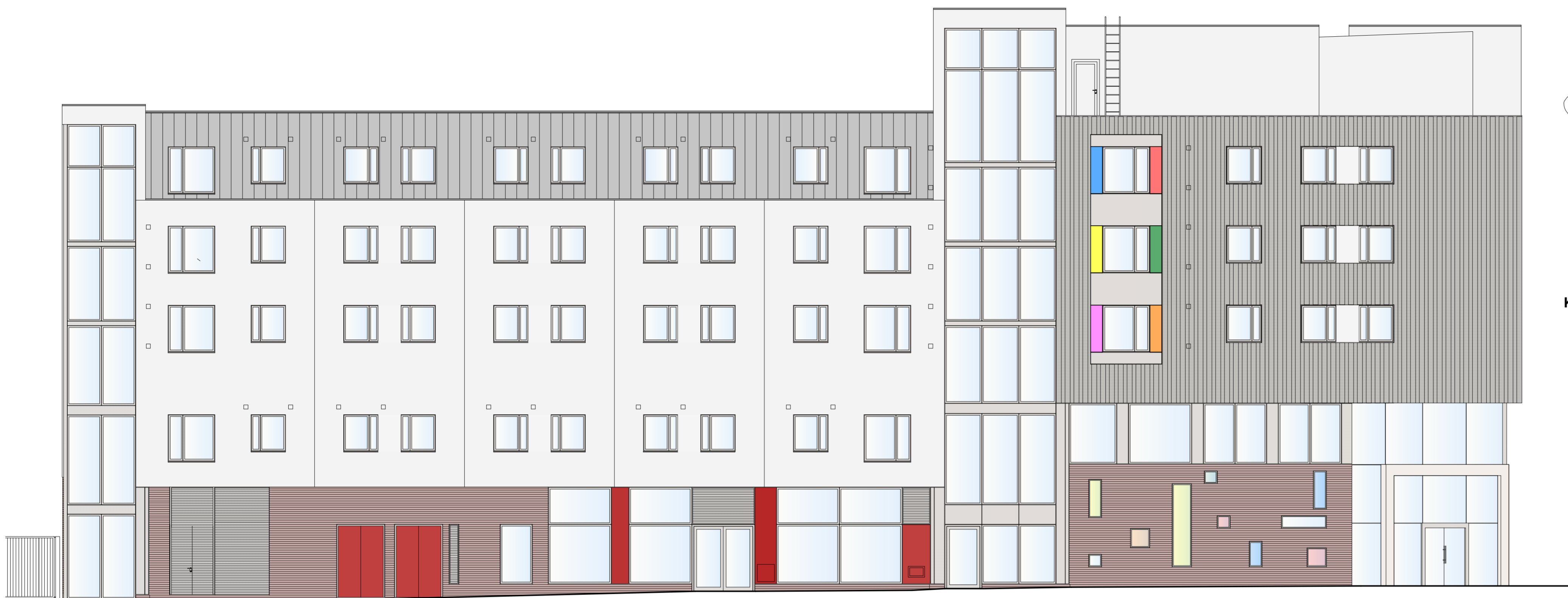
ALDENHAM STREET - ELEVATION.