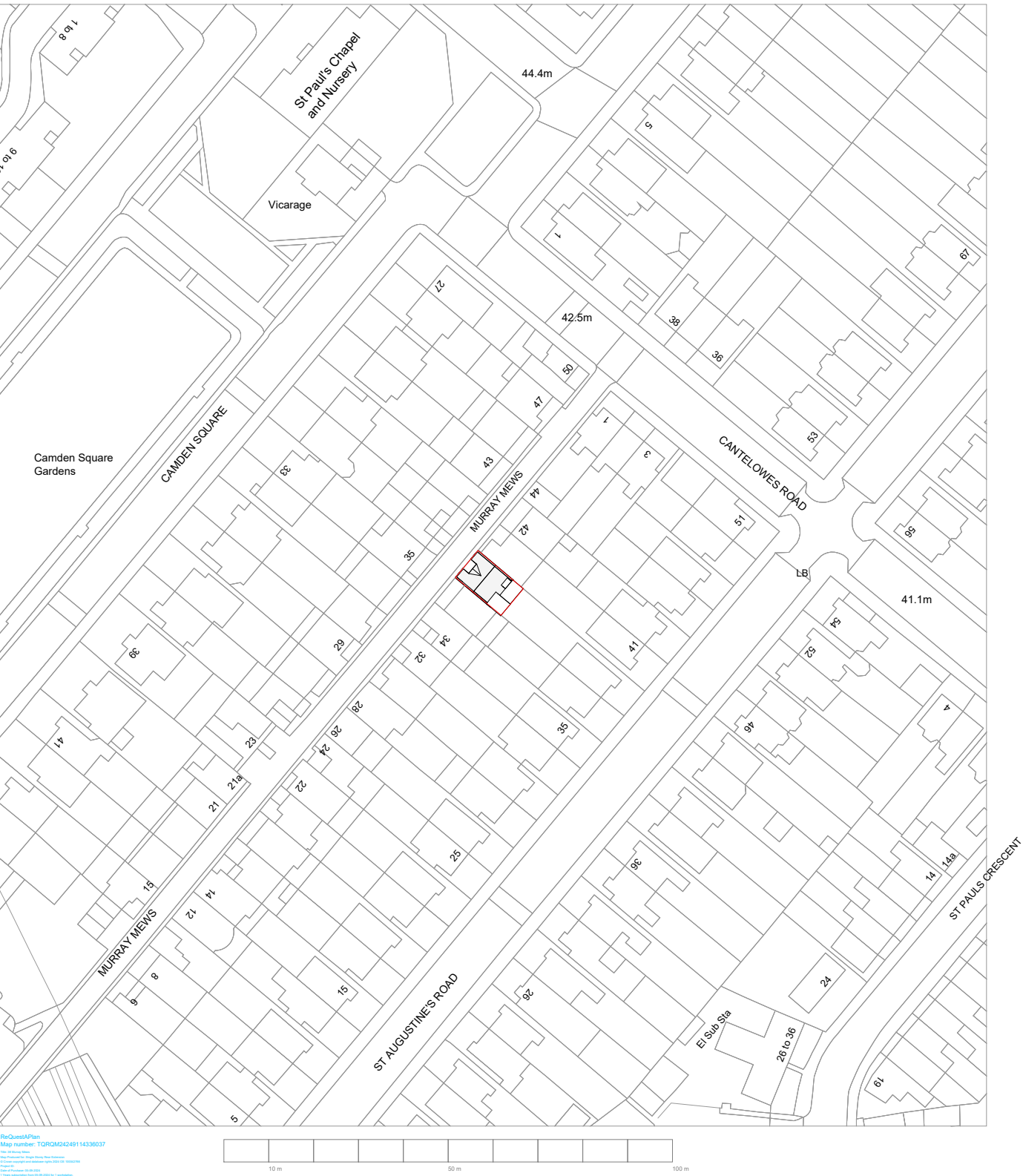
1 EXISTING LOCATION PLAN 1 : 1250