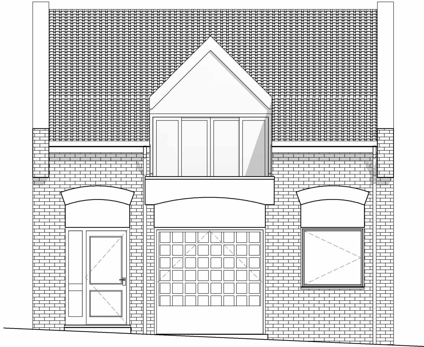
1 EXISTING SOUTH 1 : 50