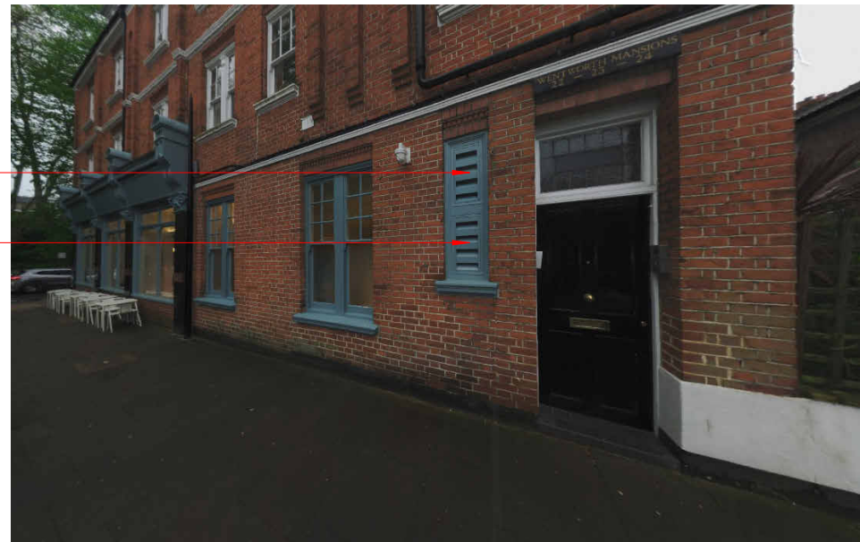
Keats Grove Elevation