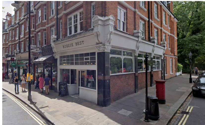
65 South End Road elevation (Biggie Best) from street.