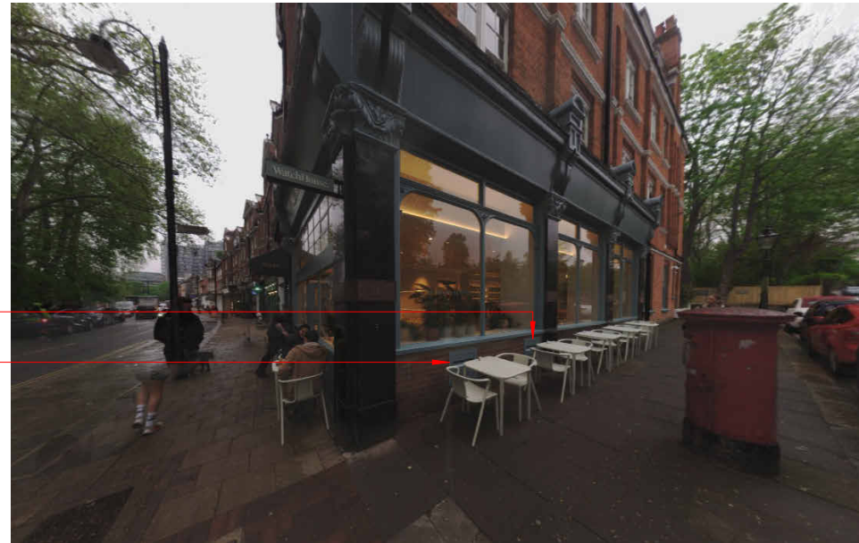
Junction of South End Road and Keats Grove