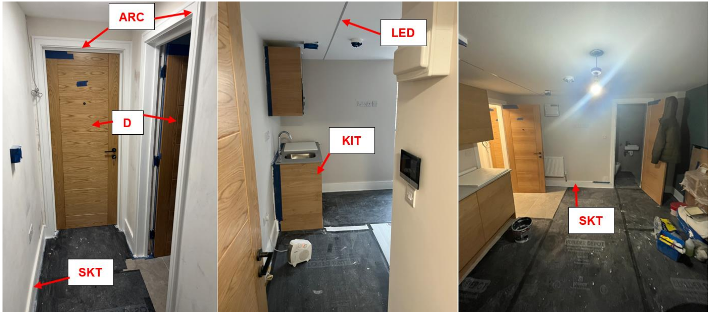
Hallway [left], front room [middle], rear room [right]: Unauthorised door architraves ( ARC ), skirting boards ( SKT ), modern doors ( D ), kitchenettes ( KIT ) & recessed LED track lighting ( LED ).