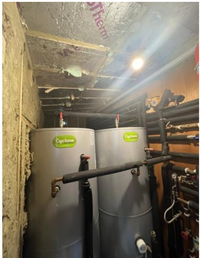
ONE unauthorised boiler outbuilding and ancillary plant equipment installed – ground floor level.