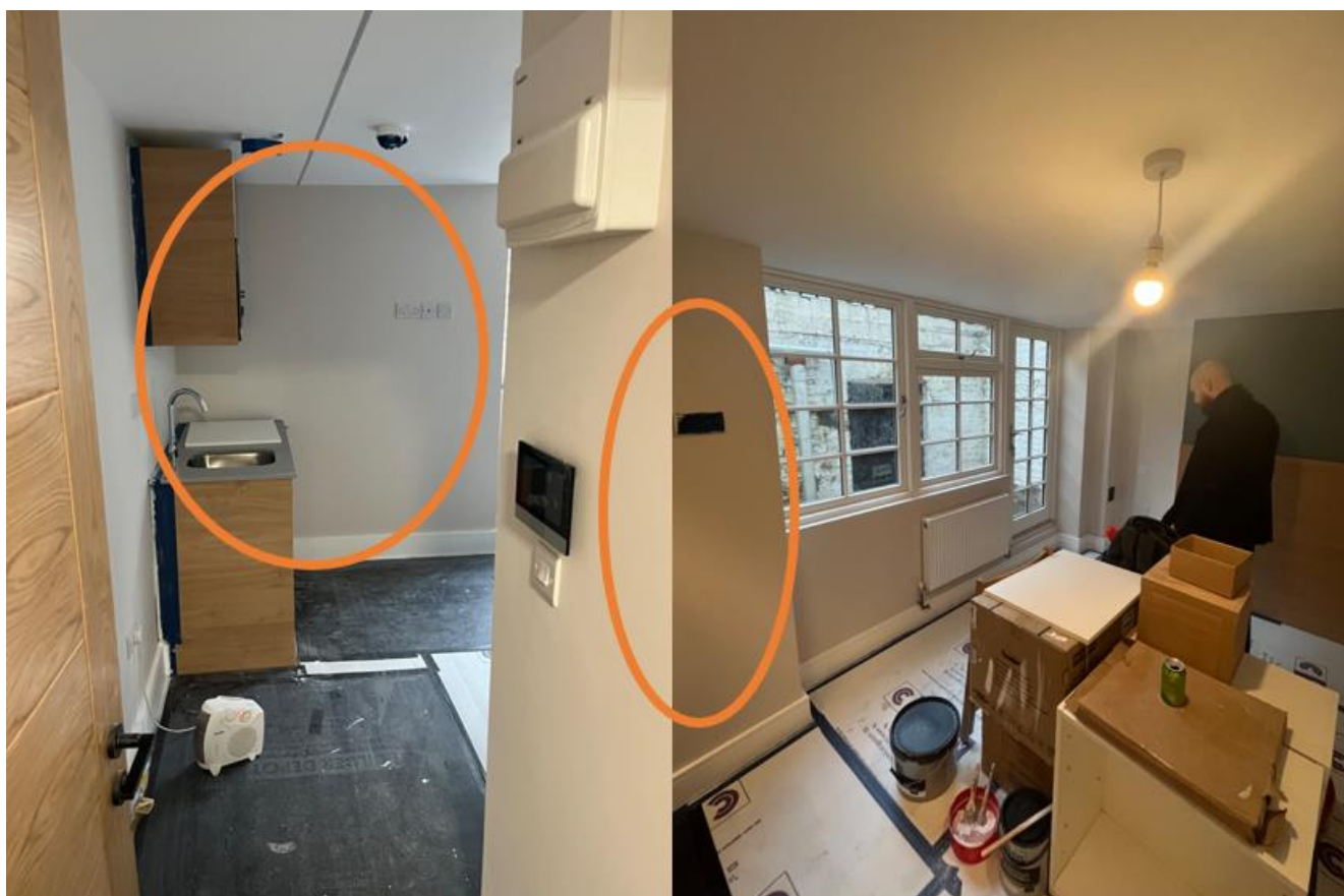
No.18 [left] & 20 [right]: Internal access into the lightwell also boarded up (circled in orange ). See below labelled plan drawing with corresponding coloured circles.