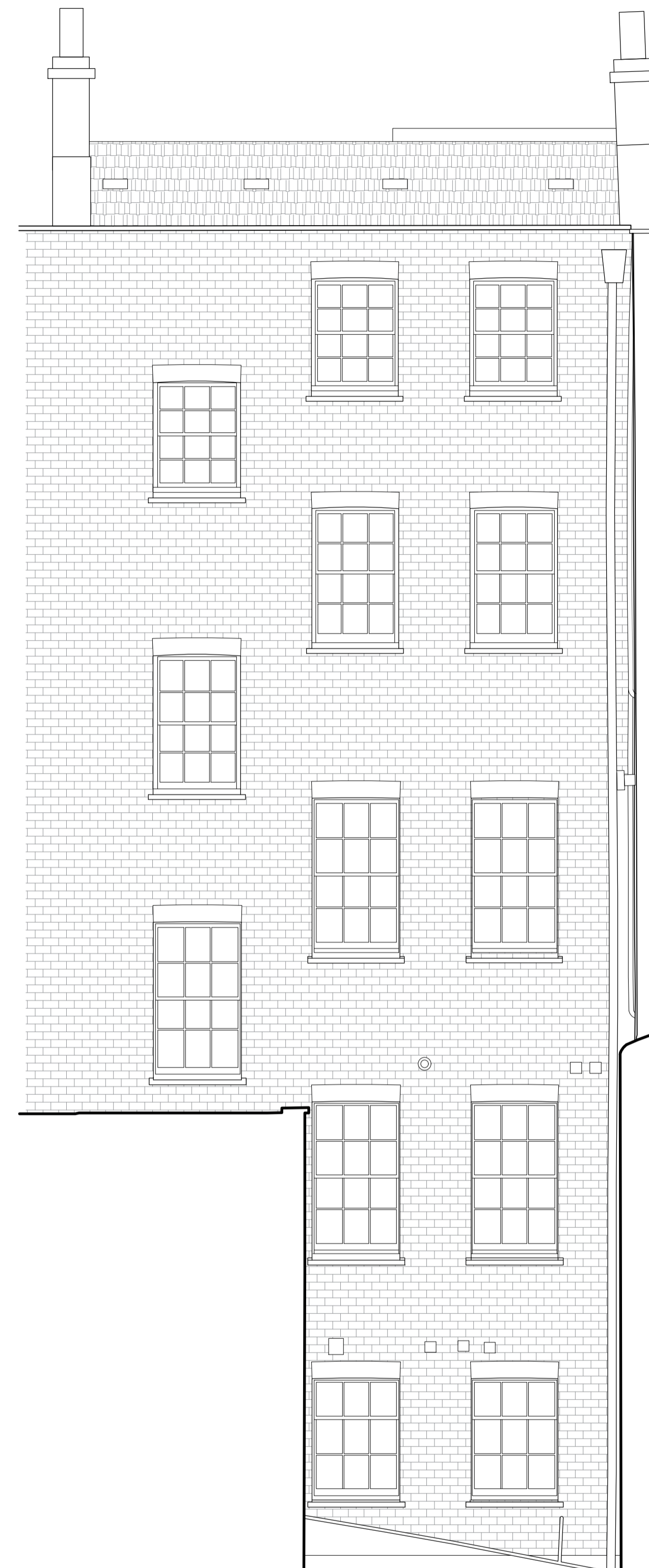
EAST ELEVATION SCALE 1 : 50