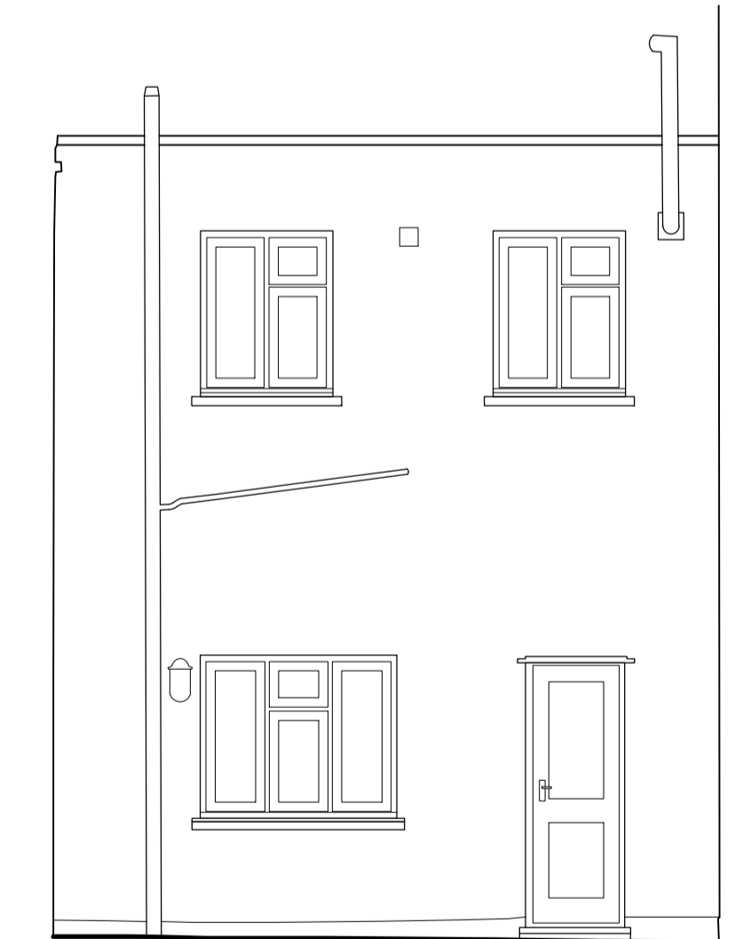
NORTH ELEVATION SCALE 1 : 50