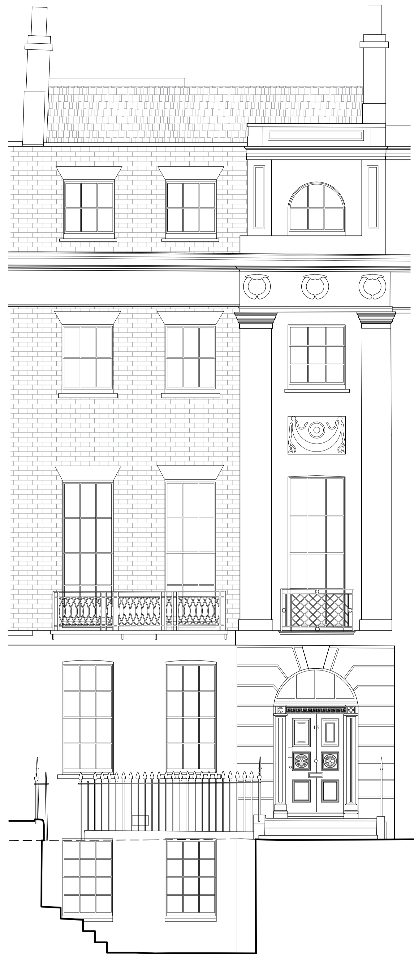
WEST ELEVATION A SCALE 1 : 50