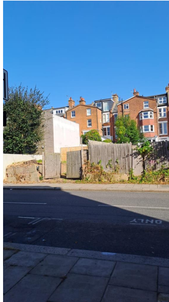
Towards Mill Lane West