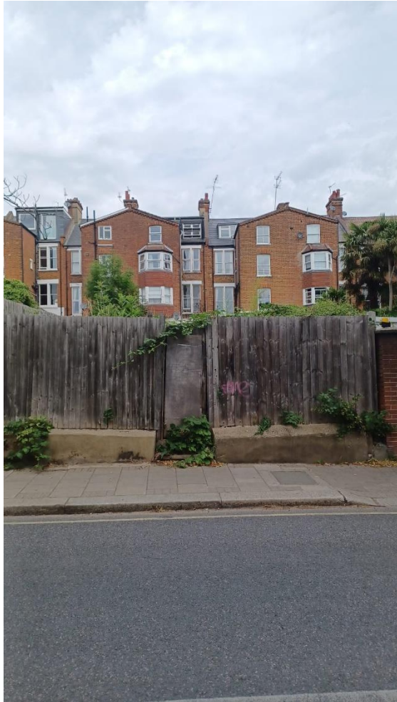
The rear of 48 Hillfield Road facing Mill Lane