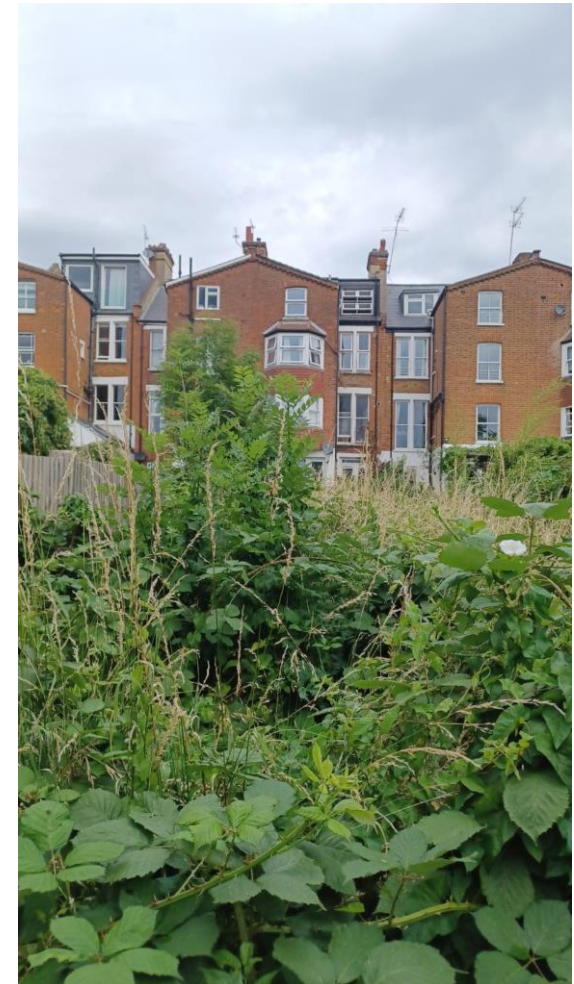
The garden of 48 Hillfield Road is unkept