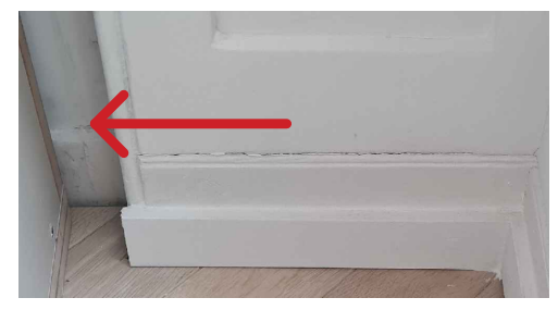
Photograph of suspected existing 'Type 5' detail - TBC