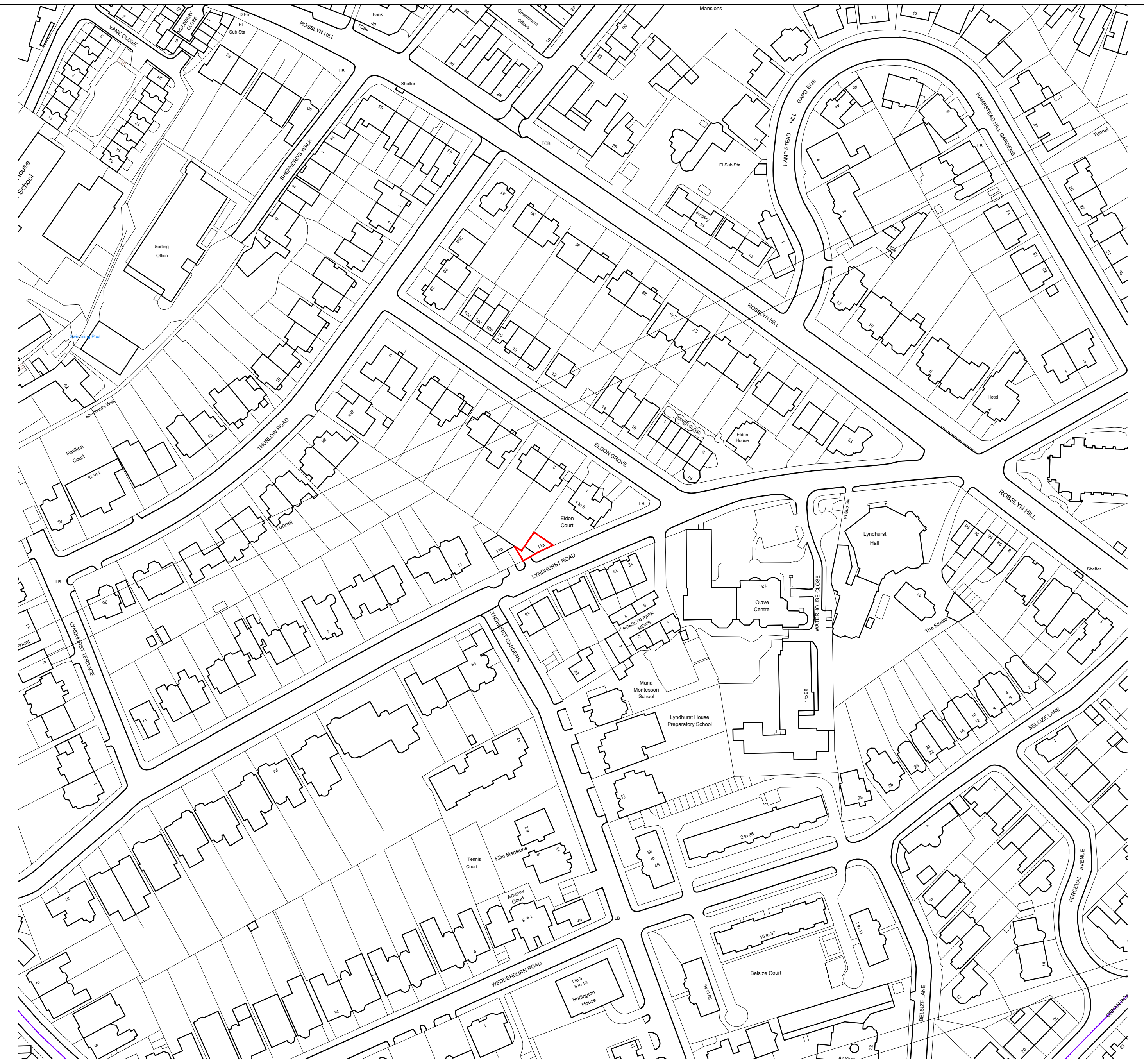
Location Plan 1:1250@A1