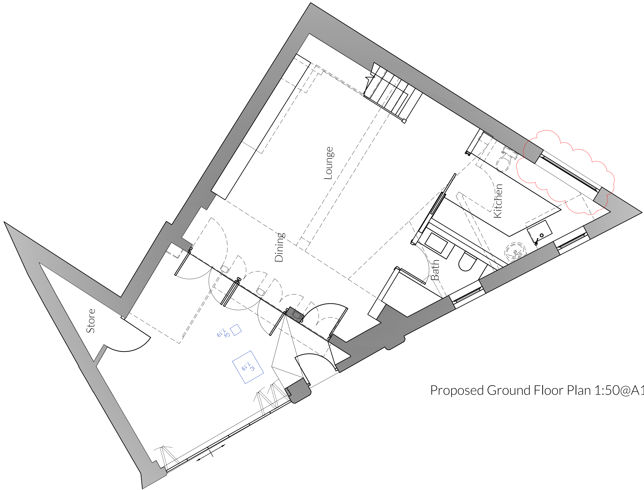
Proposed Ground Floor Plan 1:50@A1