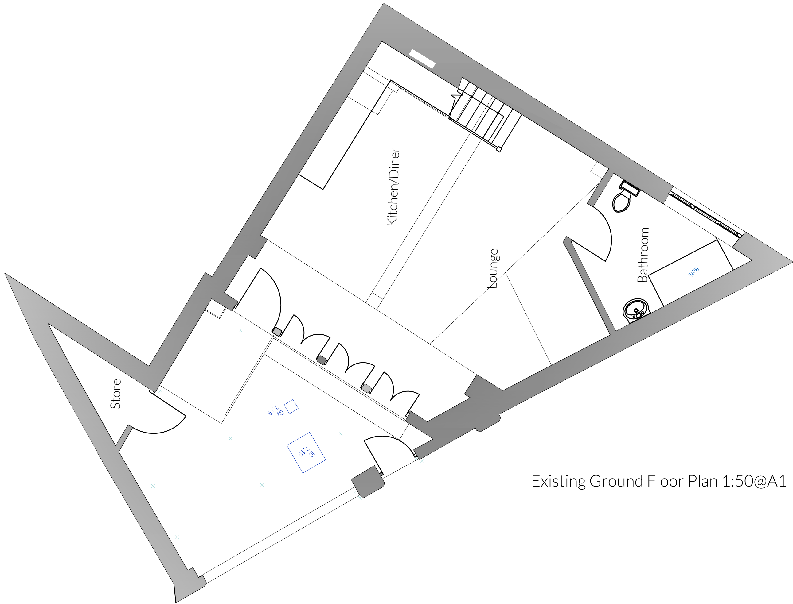
Existing Ground Floor Plan 1:50@A1