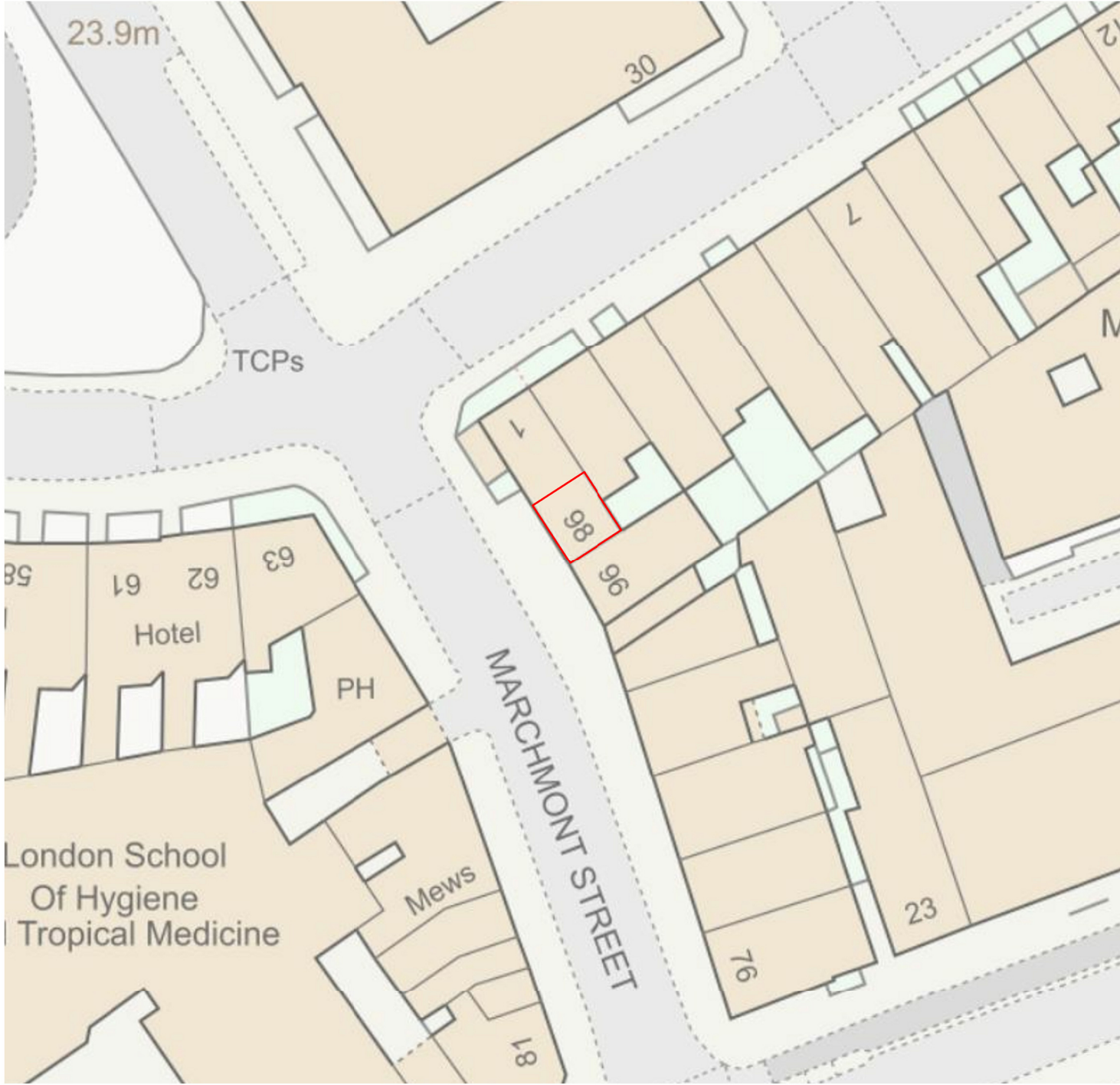
BLOCK PLAN 1 : 500 @A3