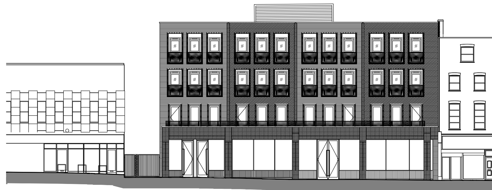
03 EXISTING FRONT ELEVATION CC 1:200

This drawing has been prepared for submission to the relevant Local Authority as part of a Planning Application. It is not intended to assist with the pricing of any elements. For Structural details refer to the Structural & Civil Engineers detailed design drawings & specifications. For M&E information, refer to the M&E Engineers and sub contractor's design drawings & specifications. For Health & Safety information, refer to the Designers Risk Assessments. This drawing is copyright and may not be reproduced in whole or part without written authority.