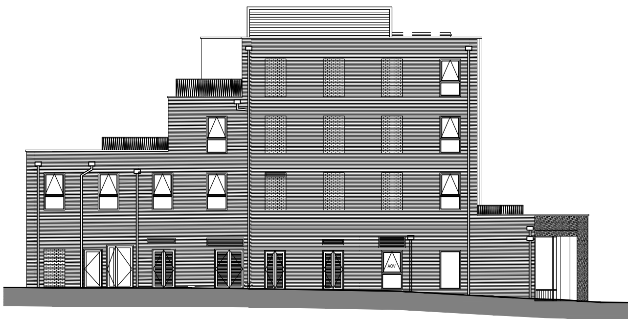
01 EXISTING SIDE ELEVATION AA 1:200