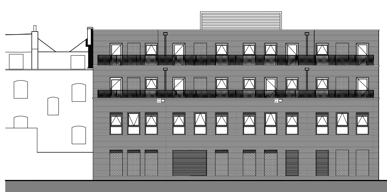
02 EXISTING REAR ELEVATION BB 1:200

This drawing has been prepared for submission to the relevant Local Authority as part of a Planning Application. It is not intended to assist with the pricing of any elements. For Structural details refer to the Structural & Civil Engineers detailed design drawings & specifications. For M&E information, refer to the M&E Engineers and sub contractor's design drawings & specifications. For Health & Safety information, refer to the Designers Risk Assessments. This drawing is copyright and may not be reproduced in whole or part without written authority.