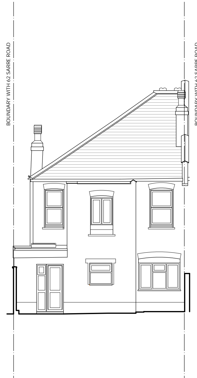
2 Existing rear extension