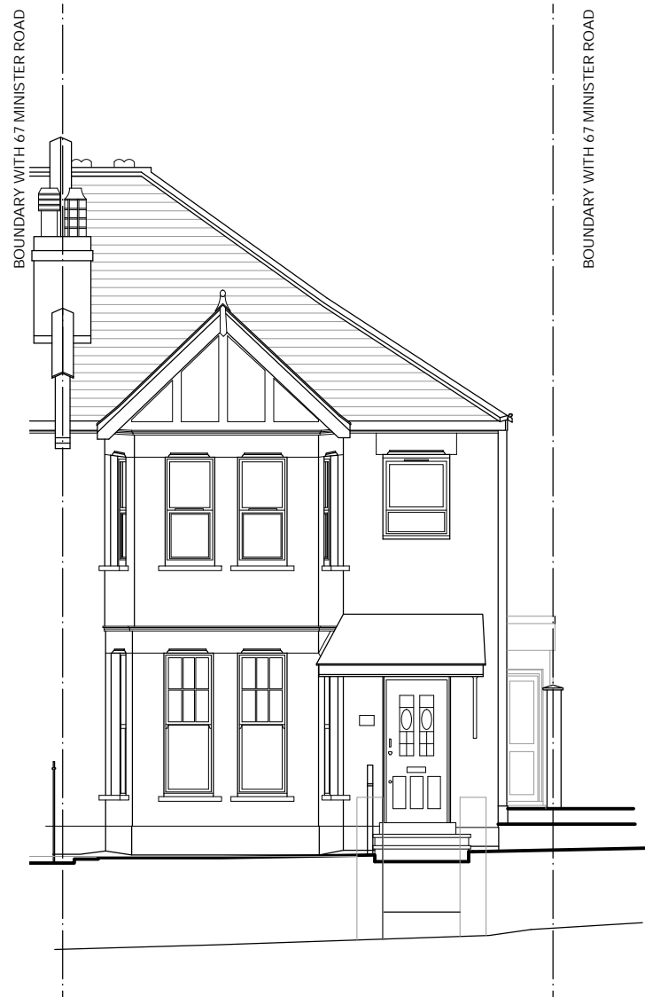
1 Existing front elevation

Do not scale from this drawing. Base survey carried out by others. Use figured dimensions only & bring any discrepancies to the attention of the Architect. Figured dimensions are in millimeters. All specified products and materials to be fitted and installed according to manufacturers specifications & instructions. All building works to be carried out in accordance with current Building Regulations, British Standards & relevant codes of practice. This drawing is the property of ROAR Architects Ltd. This drawing is copyright.