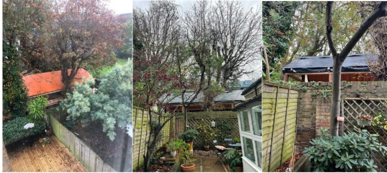
Before unpermitted structure was erected – picture taken in 2016: