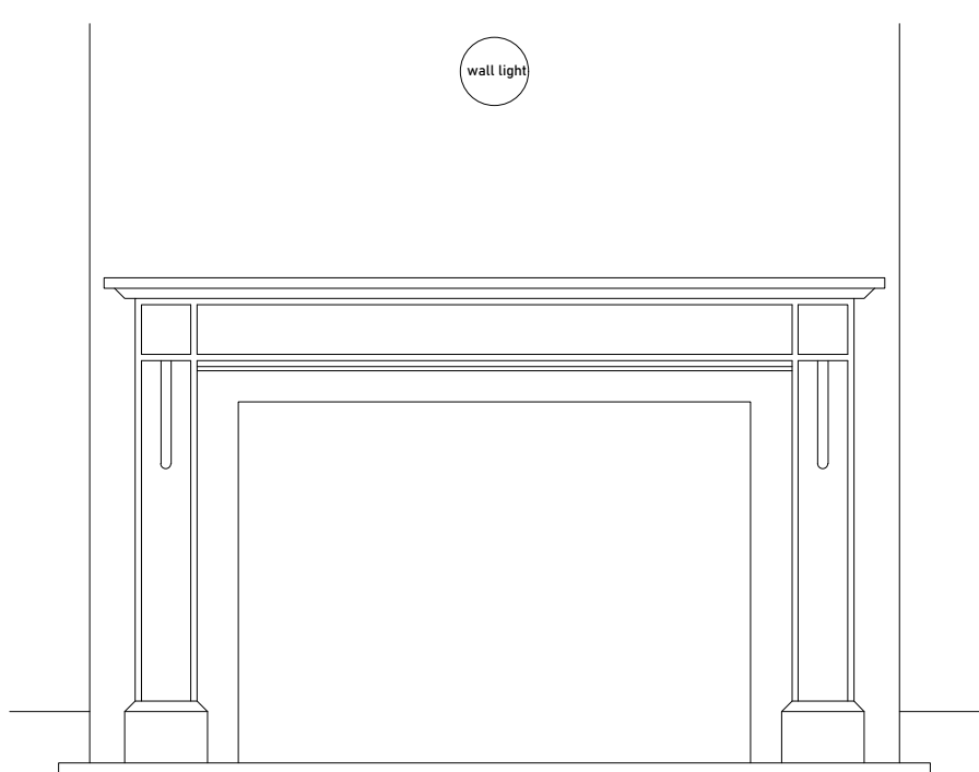
Existing fire place elevation Scale 1:20 @ A3