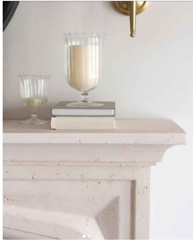
Proposed Classico Limestone - Honed finish