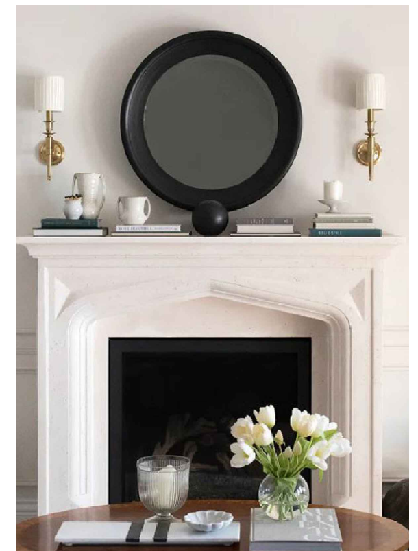
Precedent of proposed design