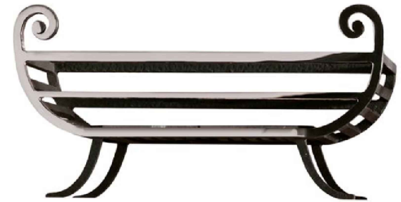
Proposed Tyndale 18 *CURVED* Freestanding Fire Basket