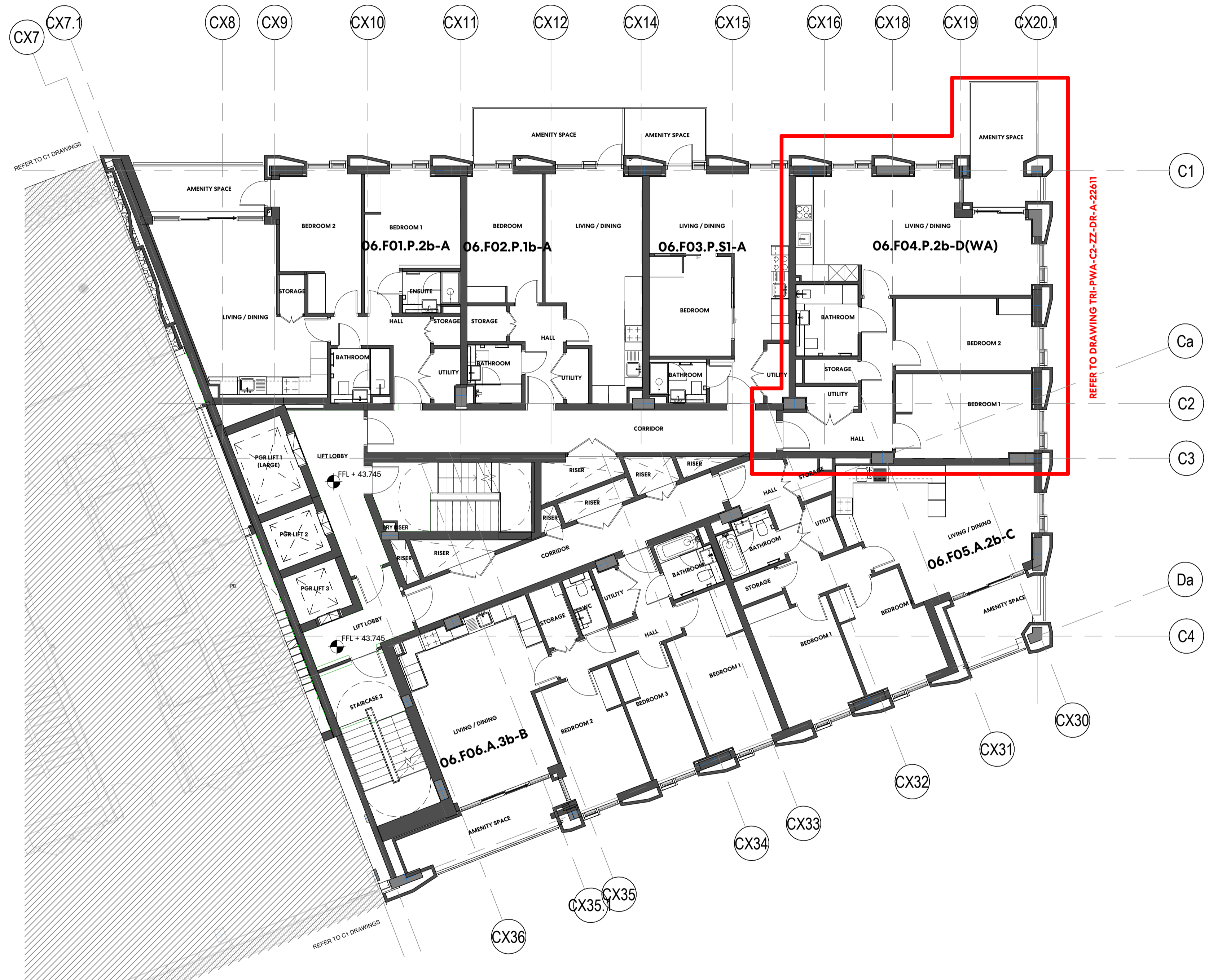
1 C2 - L06 WHEELCHAIR ADAPTABLE AND ACCESSIBLE DWELLINGS 1:100