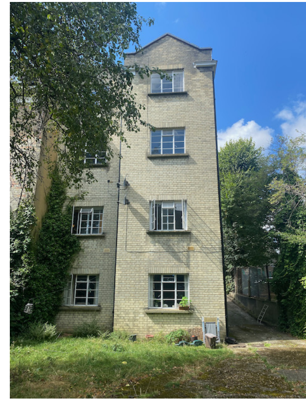
View B - Rear Elevation