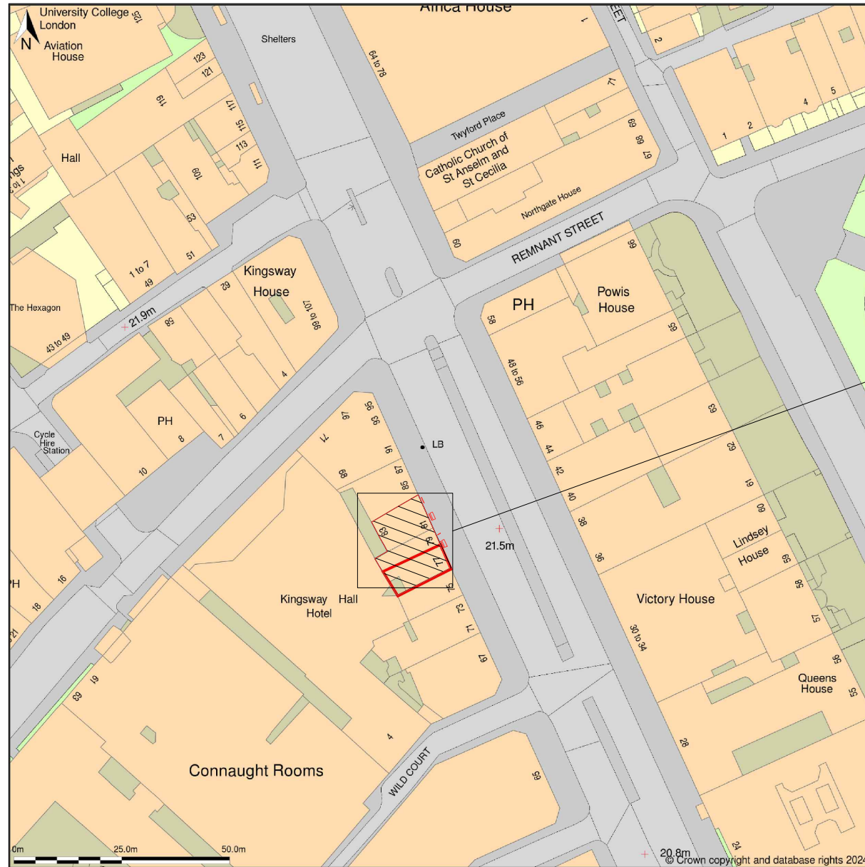
Site Plan Scale 1:1250