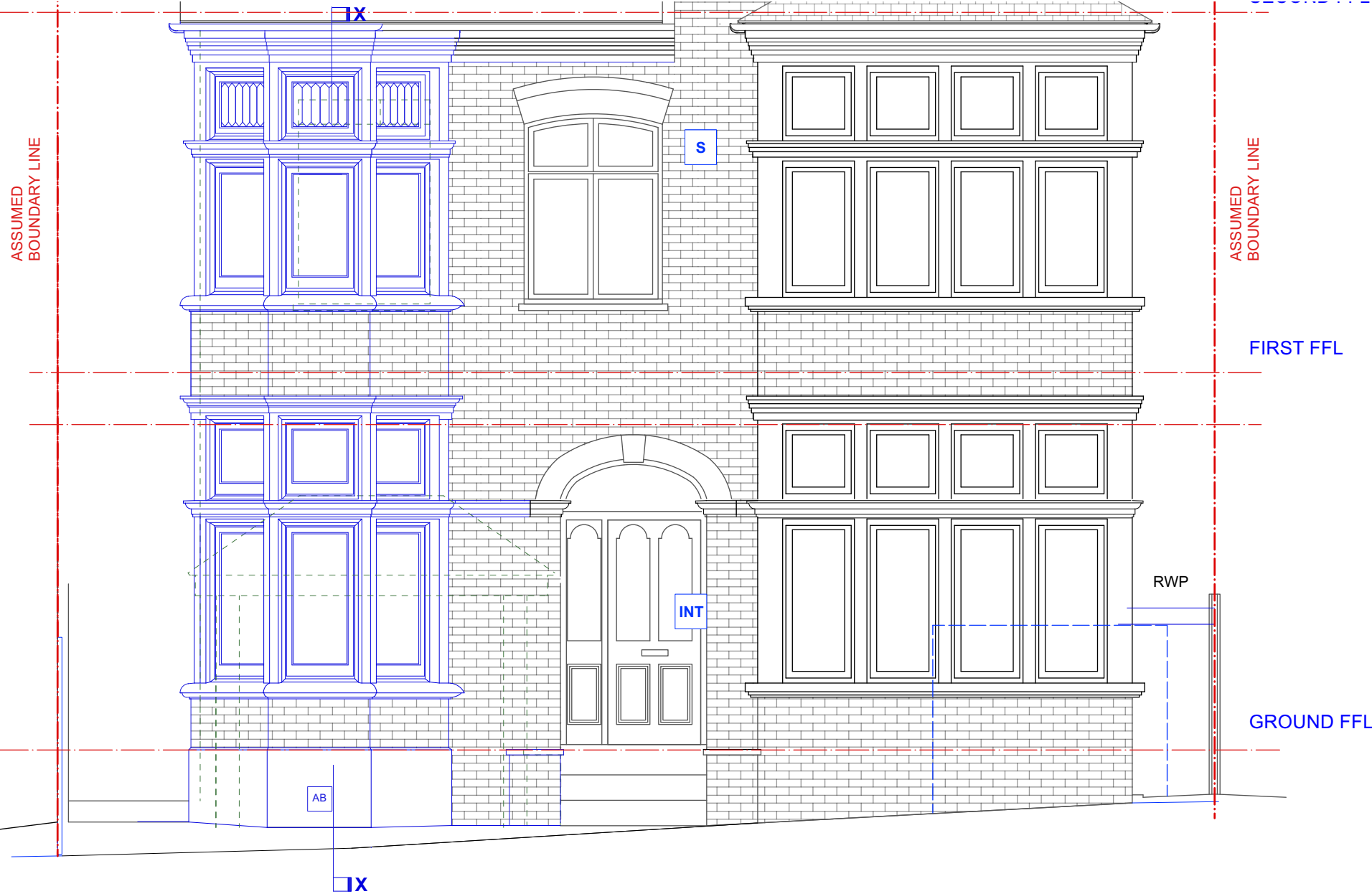
02. PART ELEVATION 1:50 @ A3