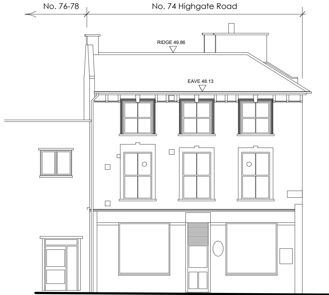
1 Existing Elevation to Highgate Road Scale: 1:100