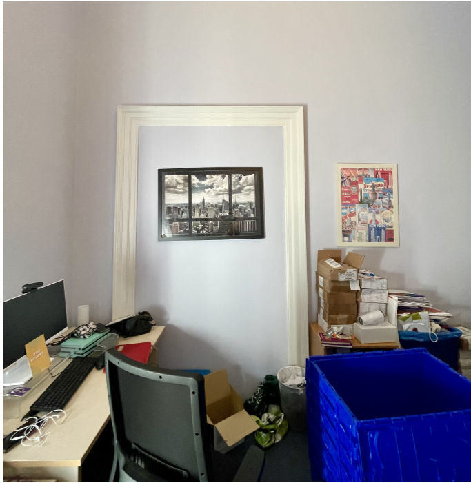
2 View of door from Room 107.