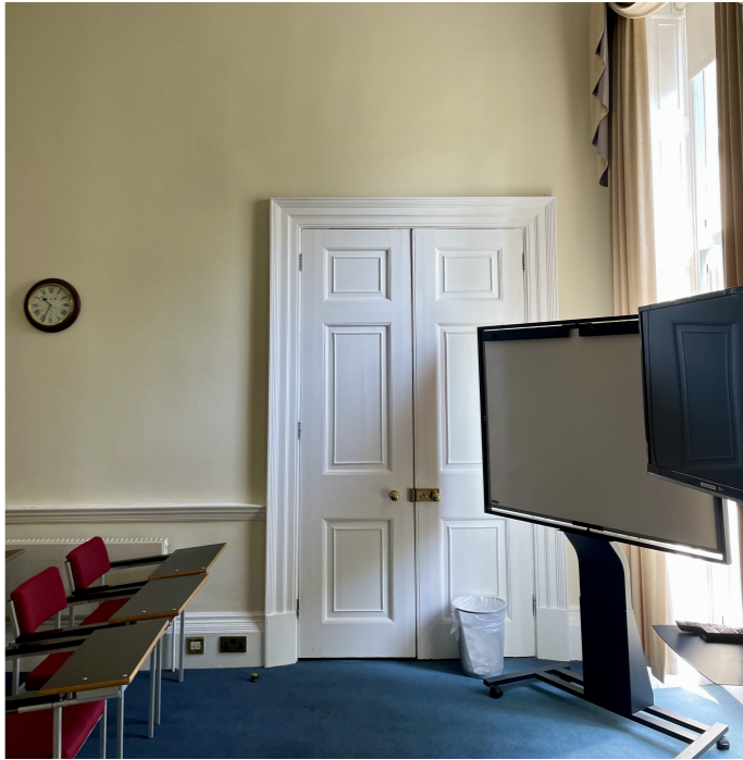
1 View of door from Room 106.